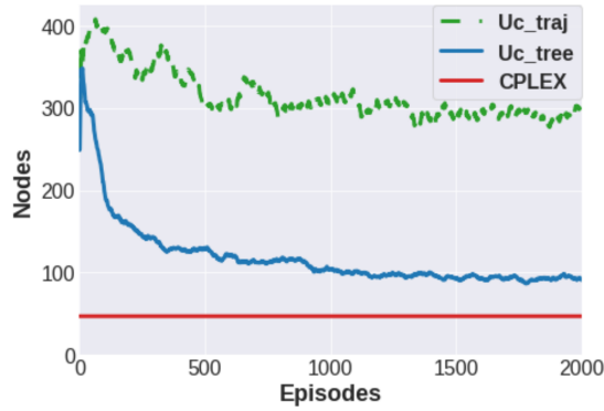
Figure 4.3. Training processes: comparison between tree-based transition ( Uc\_tree ) and trajectory-based transitions ( Uc\_traj ) for the unitary cost model.

The results obtained on energy production problems with the trajectory-based and the tree-based transition functions are presented in Figure 4.3. It represents the average size of the trees found at each step of the training. The tree-based function clearly provides better results. Note that the tree size are still larger than the one produced by CPLEX. However, given the fact that CPLEX branching policy has been improved across decades by numerous researchers, obtaining such close values in a few hours of training is a satisfying result.