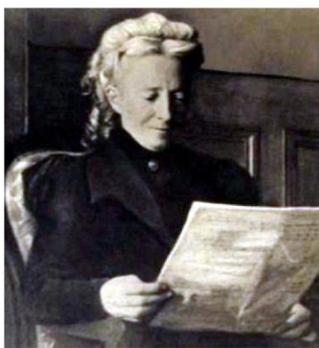
Pauline Kergomard, date inconnue