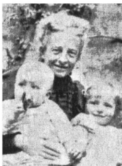
Pauline Kergomard et deux de ses petits-enfants, date inconnue