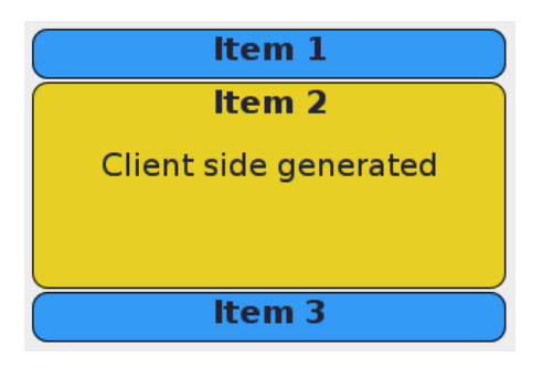
Figure 2.18: Resulting web page