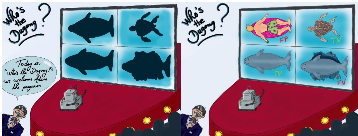
Figure 3 – Four categories of results were obtained by the AI program as it tried to recognize dugongs in images: true positive (TP), false positive (FP), true negative (TN), and false negative (FN). The program was then given an overall score for how well it could recognize dugongs.

The program's results were considered correct if the numbers of FPs and FNs were very low. The numbers of TPs, FPs, TNs, and FNs allow researchers to better understand the AI program's mistakes, which can help them find ways to improve the program.