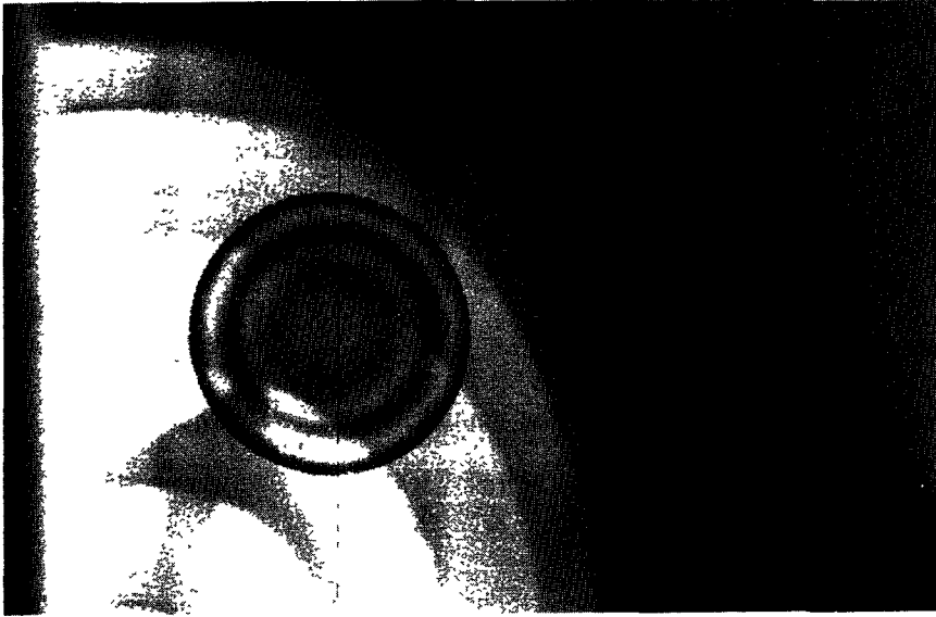
Fig. 1. — Snapshot of the spreading for a PDMS silicone oil droplet ( \Omega = 2 \mu\text{l} , M_w = 410 Daltons) : we can see colored interferences on the drop surface. A liquid rim is formed at the drop periphery and the contact line is periodically modulated.