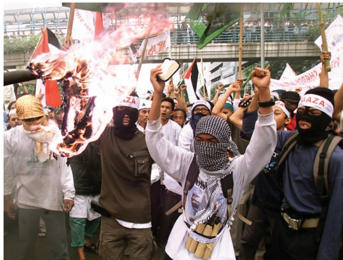
Fig. 4. Moslem youth with Quran dressed as a Palestinian suicide bomber demonstrating outside the United Nations office in Jakarta, Indonesia (April 2002). (Indonesia is the most populous Moslem nation.)

Perhaps to stop the bombing we need research to understand which configurations of psychological and cultural relationships are lurking and binding thousands, possibly millions, of mostly ordinary people into the terrorist organization’s martyr-making web. Study is needed on how terrorist institutions form and on similarities and differences across organizational structures, recruiting practices, and populations recruited. Are there reliable differences between religious and secular groups, or between ideologically driven and grievance-driven terrorism? Interviews with surviving Hamas bombers and captured Al-Qaida operatives suggest that ideology and grievance are factors for