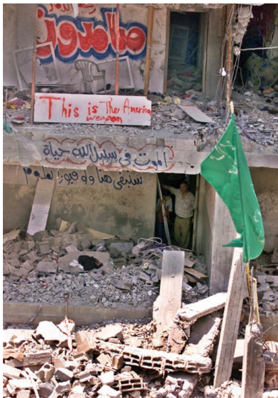
Fig. 2. Wreckage in Gaza after an Israeli attack that killed Salah Shehadeh, Hamas military commander. It features the green Hamas flag, and Arabic graffiti reads: “We are resisters, death in the way of Allah is the life.”

groups were provided opportunities to pool and to unify doctrine, aims, training, equipment, and methods, including suicide attack. Through its multifaceted association with regional groups (by way of finance, personnel, and logistics), Al-Qaida aims to realize flexibly its