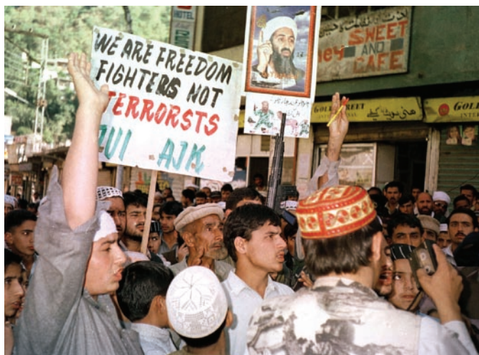
Fig. 1. Chanting demonstrators in Pakistan-held Kashmir defending Osama bin Laden’s actions and ambitions as freedom-fighting (November 2001).

Suicide attack is an ancient practice with a modern history (supporting online text). Its use by the Jewish sect of Zealots ( sicari ) in Roman-occupied Judea and by the Islamic Order of Assassins ( hashashin ) during the early Christian Crusades are legendary examples (5). The concept of “terror” as systematic use of violence to attain political ends was first codified by Maximilien Robespierre during the French Revolution. He deemed it an “emanation of virtue” that delivers “prompt, severe, and inflexible” justice, as “a consequence of the general principle of democracy applied to our country’s most pressing needs.” (6). The Reign of Terror, during which the ruling Jacobin faction exterminated thousands of potential