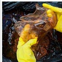
Death Does Not Deter Jellyfish Sting