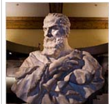
A Museum Display of Galileo Has a Saintly Feel

Home | World | U.S. | N.Y./Region | Business | Technology | Science | Health | Sports | Opinion | Arts | Style | Travel | Jobs | Real Estate | Automobiles | Back to Top