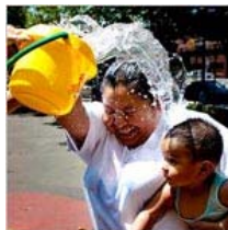
No Matter How You Cut It, a July That's Too Hot