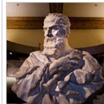
A Museum Display of Galileo Has a Saintly Feel

Home | World | U.S. | N.Y./Region | Business | Technology | Science | Health | Sports | Opinion | Arts | Style | Travel | Jobs | Real Estate | Automobiles | Back to Top