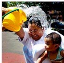
No Matter How You Cut It, a July That's Too Hot