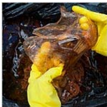
Death Does Not Deter Jellyfish Sting