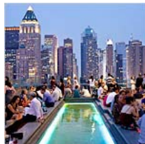
Manhattan's Rooftop Bars: Heaven's Gates