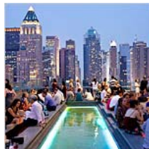
Manhattan's Rooftop Bars: Heaven's Gates