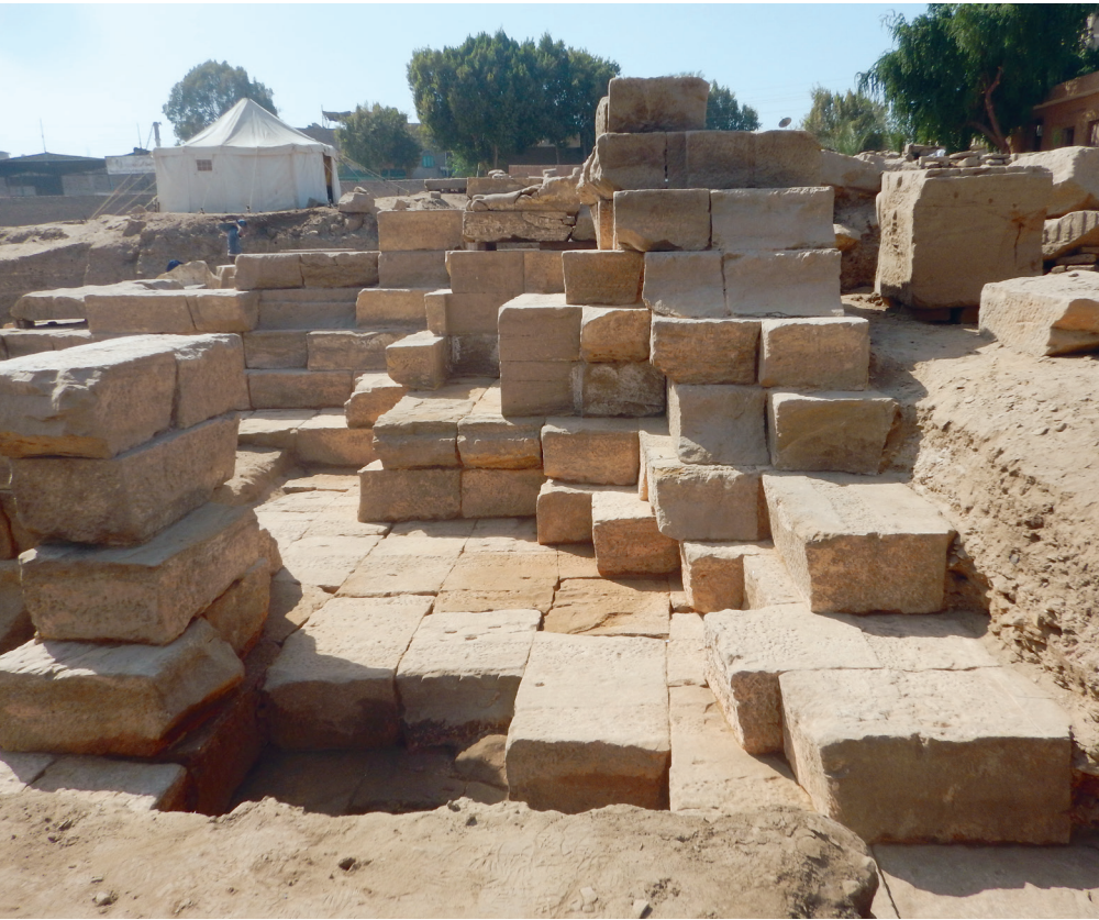
3. Foundation layers of the Ptolemaic naos, at the back of the temple.

structure's stonework from the 5th century. Work there was conducted intermittently by the Supreme Council of Antiquities (SCA) in the 1980s and 1990s, exposing in particular a set of crypts. In 2003 and 2004, under the auspices of the IFAO, the two short seasons led by Christophe Thiers and Youri Volokhine enabled the texts of these crypts, which date to Ptolemy XII Neos Dionysos (80-51 BC), to be copied and published. It was only after 2004-2005 that work was undertaken to attempt to understand the scattered remains in the city in their entirety and to propose an architectural, topographic and epigraphic analysis of the ruins of the main temple of the god Montu. At the same time an inventory of blocks scattered over the site and a programme of restoration and conservation was initiated.