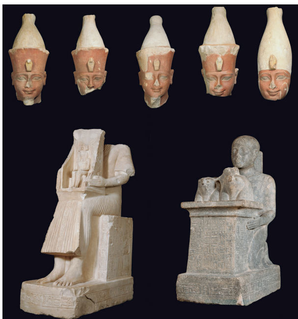
5. Royal and private statues after restoration.