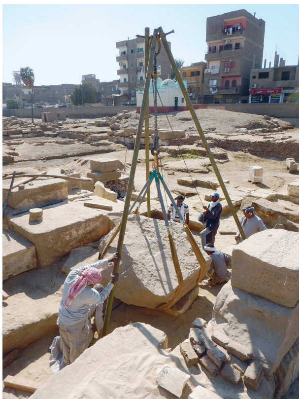
4. Movement of blocks in the central area of the temple.