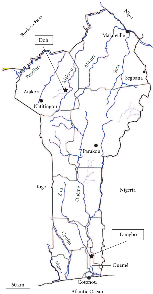
FIGURE 1: Locations of the study sites of Doh (north Benin) and Dangbo (south Benin).

was followed for the positive urine samples from the school at Dangbo. A subsample of the eggs was used immediately in saline solution for morphological analyses. The remaining eggs were left to hatch in spring water and each of the resulting miracidia was transferred using a Pasteur pipette into a 1.5 mL PCR reaction tube in 2 \mu L of well water for molecular analysis. We verified the actual presence of the miracidium and also that there was only one miracidium in each tube, using a binocular microscope.