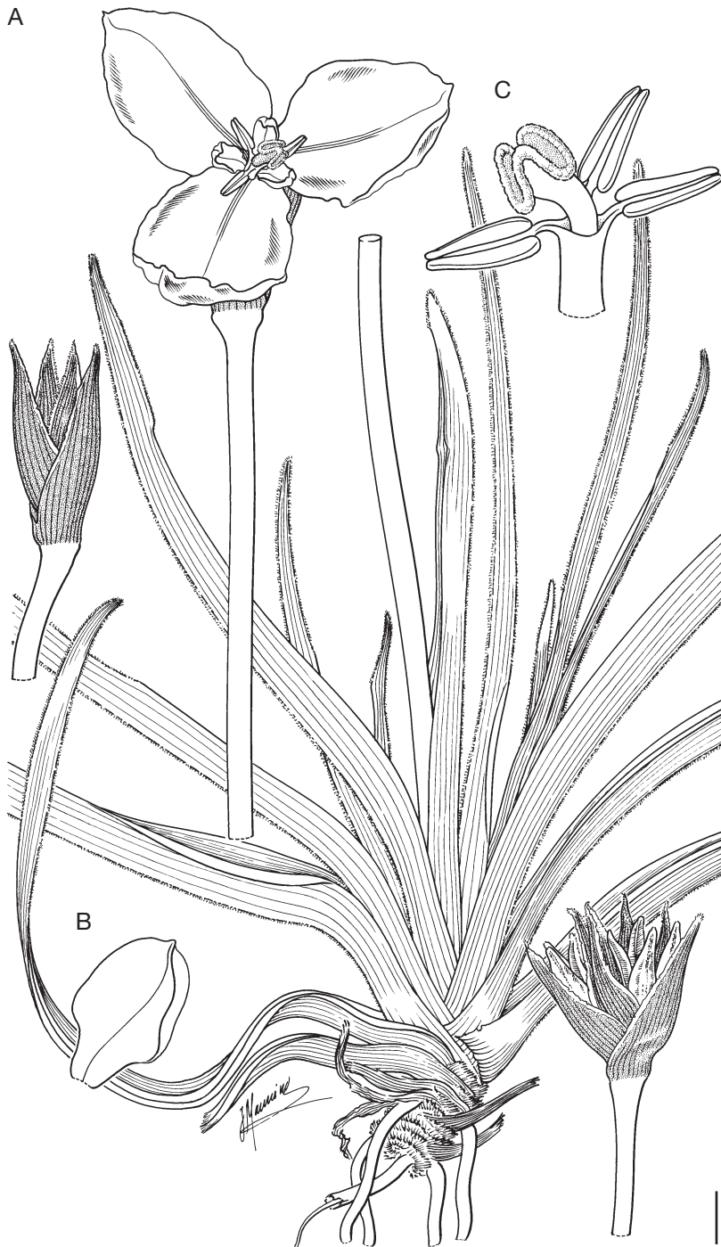
FIG. 1. — Patersonia neocaledonica Goldblatt & J.C. Manning sp. nov.: A , habit, including separate young inflorescence and infructescence; B , inner tepal; C , detail of anthers and stigma. Pillon et al. 1156 (MO). Scale bar: A, 10 mm; B, 2 mm; C, 2.5 mm. Drawing by John Manning.