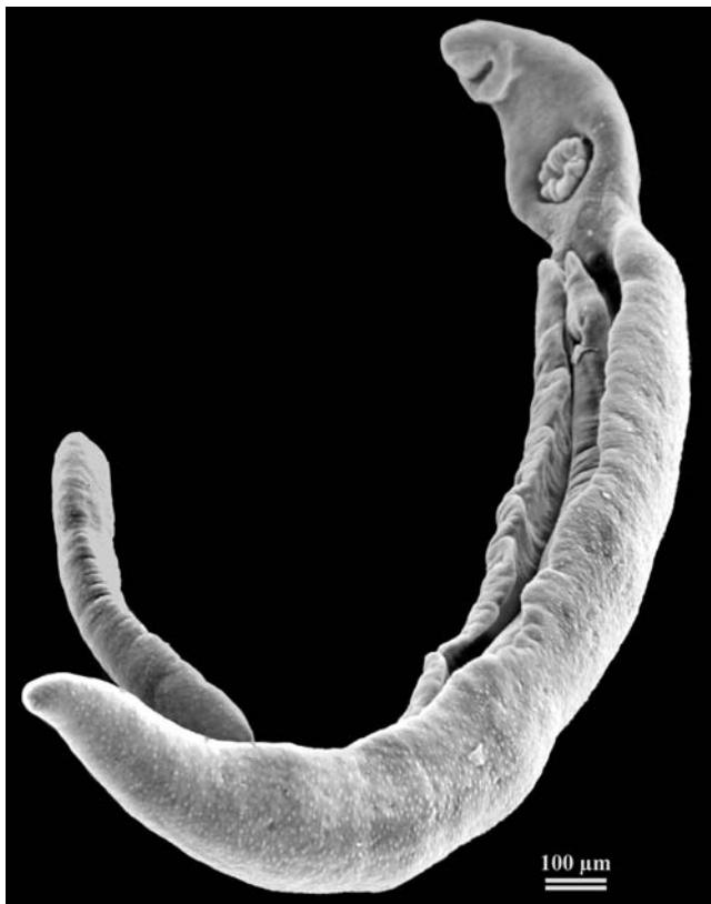
Figure 1. A schistosome pair, with the thin female located in the male gynaecophoral canal. doi:10.1371/journal.pone.0003328.g001

To that end, we performed multiple infections of definitive hosts with a first infection using parasites of both sexes followed by either male or female re-infection. Divorce rate per host ranged between