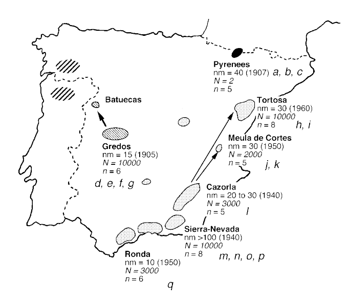
Fig. 1. Geographic distribution of populations studied. The taxonomically recognized subspecies of Capra pyrenaica (Cabrera, 1911) are noted. nm, indicates the minimum historic population size; N, the present population size. Arrows show translocation of individuals from Gredos to Batuecas (reintroduction) and from Cazorla to Muela de Cortes and Tortosa (reinforcement). n is the number of samples analysed per population to estimate the within-population polymorphism. The 17 individuals (a to q) studied to make the phylogenetic inference are also localized on the map.

, Capra pyrenaica pyremaica; Capra pyrenaica victoriae; Capra pyrenaica hispanica; ZZ, Capra pyrenaica lusitanica (extinct).