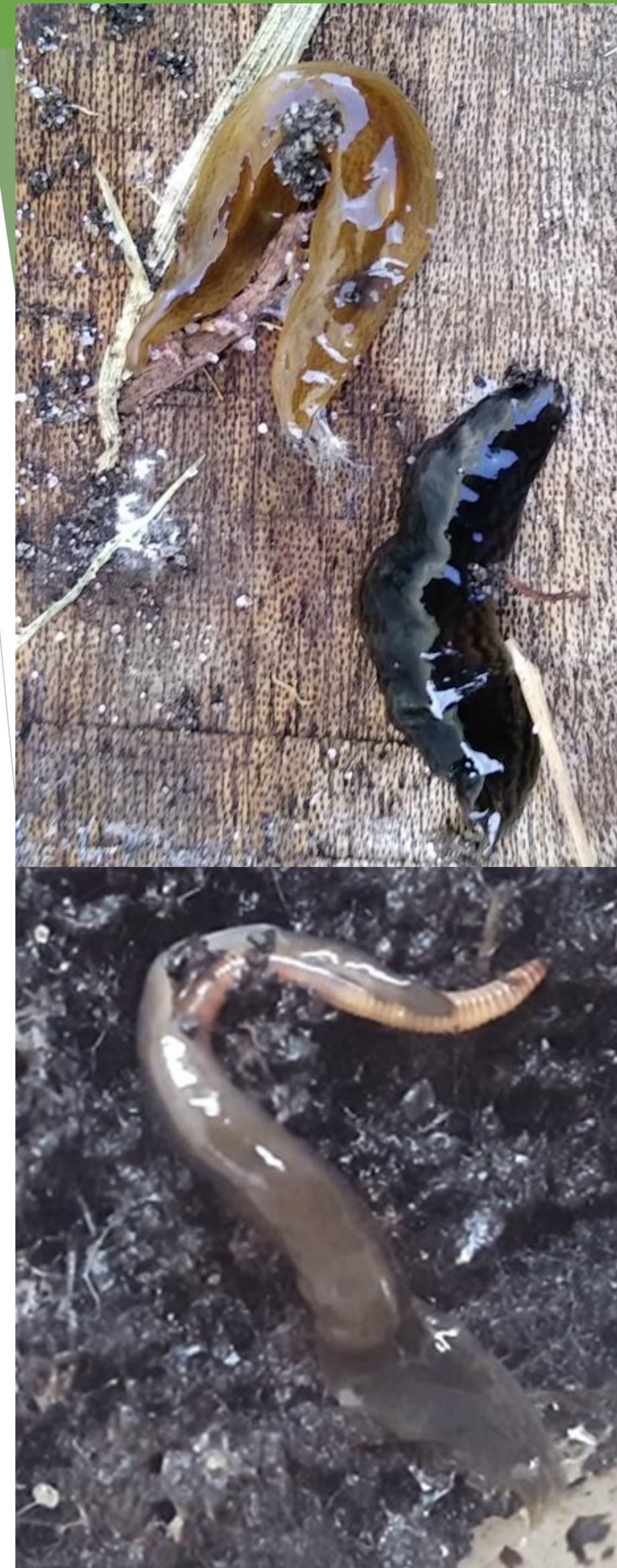
Fig.1. O. nungara specimens of different colors and attacking an earthworm

The 6 species most frequently consumed by O. nungara with their ecological category: