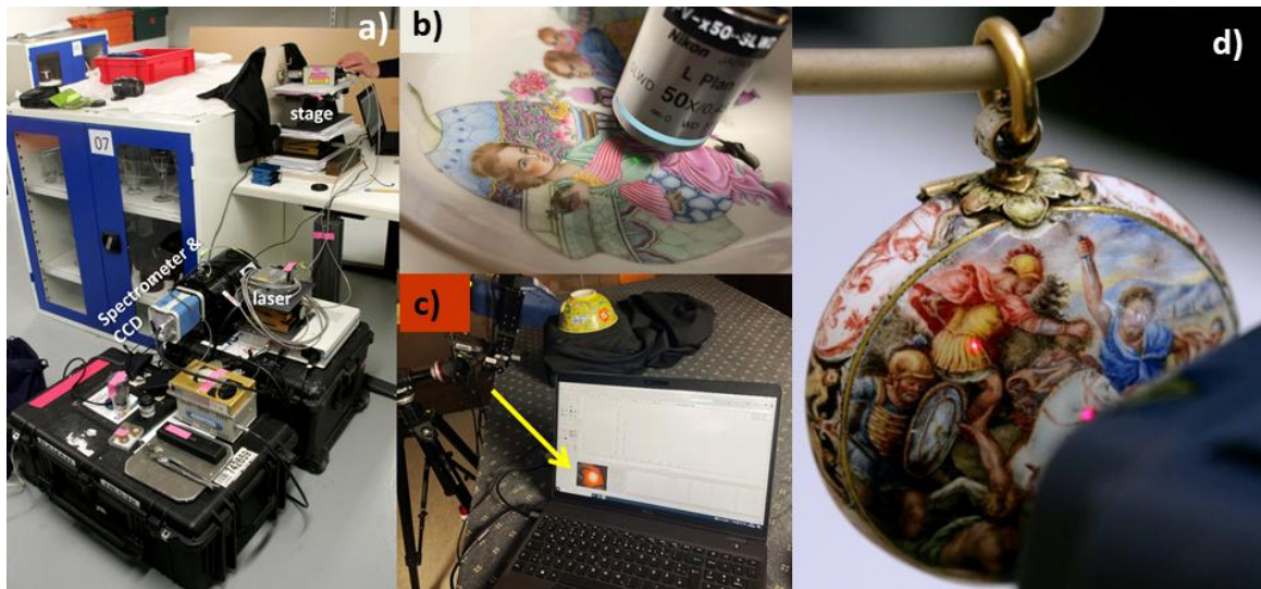
Figure 1. (a) Mobile Raman analysis device. (b) The laser spot halo for Raman analysis. (c) Mobile XRF analysis device. The motorized positioning of the XRF spectrometer on a stand is controlled to the nearest millimeter by a camera. (d) The coincidence of two laser spots is shown on the piloting laptop (yellow arrow in (b)); the positioning of the laser spot for Raman analysis is controlled by three manual micrometric screws on the stage shown in (a).

the surface area varies between \sim 1 and 500 \mu\text{m}^2 . Both techniques allow mapping by displacement of the analysis area.