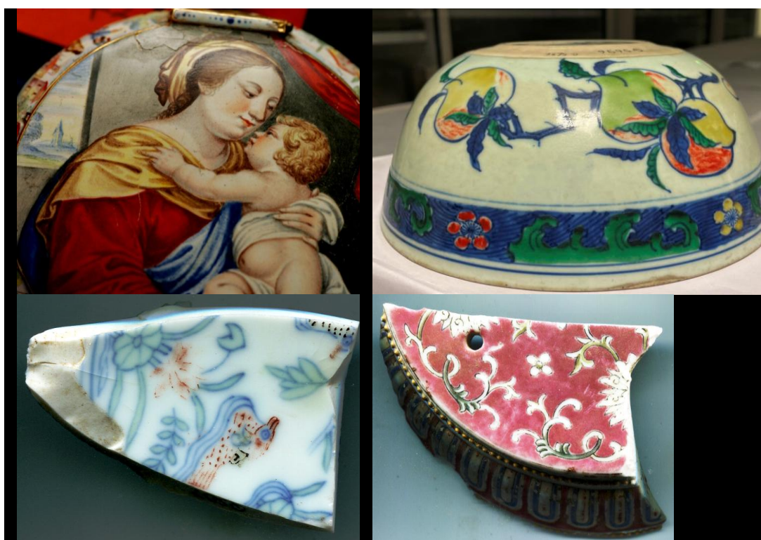
Figure 2. (a) French enamel decoration of a watch, ca. 1640 (inv. OA8428, Coll. Musée du Louvre, Paris). (b) For comparison of know-how in the same period, an enamel decoration of a Chinese doucai bowl dating from the second half of the seventeenth century to the beginning of the eighteenth century (inv. G5696, Coll. Musée national des Arts asiatiques-Guimet, Paris). (c) Famille verte porcelain shard (private coll.). (d) Famille rose porcelain shard (private coll.)

In the sixteenth century, painting was the major European artistic technique: paintings reached very high values and works were based on the mastery of a wide range of colors. At this time, the decoration of ceramics (majolica from Urbino, Lyon, Faenza, etc.) began to be inspired by “fashionable” paintings, often scenes from Greek or Roman mythology or the Bible, or of famous people. Enamellers on metal, in particular in Limoges or those working for the court of France who settled in Blois, then in Paris, in the seventeenth century (Colomban et al. 2020), developed techniques that allowed a range and quality equal to that of pastel or oil paint (figs. 1 and 2). At that time, Chinese craftsmen had a very limited palette because their only coloring agent was created by the dissolution of transition-metal ions in the vitreous network. The decoration was either monochrome, made by coloring the cover or by laying under the cover a drawing in blue (the famous blue and white) or limited to a few flat colors such as in watercolor.