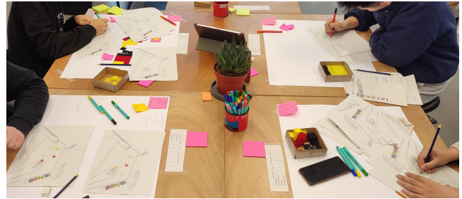
Figure 2: Picture of one of the Autocomplete speculative design workshop.

Methodologically, the authors organized a speculative design workshop structured in three phases. First, to ground participants' speculation in a concrete design activity, they asked 15 participants