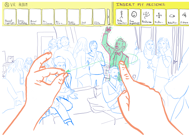
Figure 4: Illustration of the scenario “buy a frame” that allows you to insert your picture into the memory photo of fiend’s album.

or malicious futures. As such, the paper adopts a critically oriented speculative frame, aiming to foreground risks before these technologies become widely deployed.