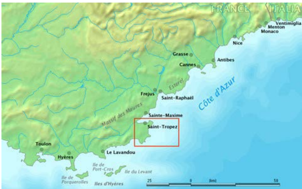
Figure 2 - Location of the Saint-Tropez Peninsula (France).