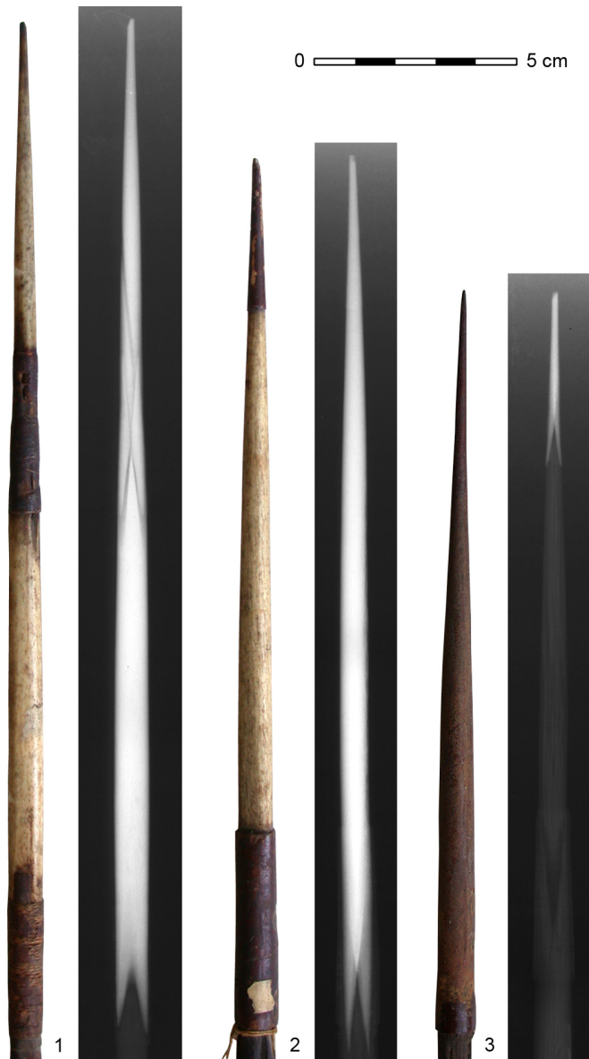
Figure 5. The three types of points on the Santa Cruz arrows: photograph and radiograph (Musée d'Aquitaine, Bordeaux; after Pétilion et al., 2013, with scale correction). 1: composite point; 2: large point; 3: small point. Radiographs: M. Bessou, UMR 5199 PACEA.