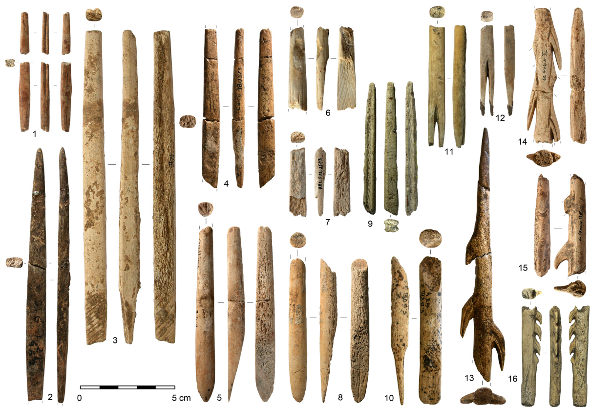
Figure 1. Sample of Magdalenian antler points with representative cross-sections. Lower Magdalenian: 1, double point with longitudinal grooves, Saint-Germain-la-Rivière lower assemblage. Middle Magdalenian: 2, point with lanceolate base, Saint-Germain-la-Rivière upper assemblage; 3, double bevel-based point, Roc-de-Marcamps; 4, double bevel-based point, Combe-Cullier UA4c; 5, single bevel-based point, Oulen; 6, single bevel-based point, Marsoulas; 7, single bevel-based point, Roc-de-Marcamps 2; 8, single bevel-based point, Tastet US306; 9, mesial fragment of point with longitudinal grooves, Saint-Michel. Upper Magdalenian: 10, double bevel-based point, Duruthy 3; 11, fork-based point, Espalungue; 12, fork-based point, Laa 2 C3; 13, bilaterally barbed point, Duruthy 3; 14, bilaterally barbed point, Morin AIV; 15, unilaterally barbed point, Morin BII; 16, unilaterally barbed point, Espalungue.