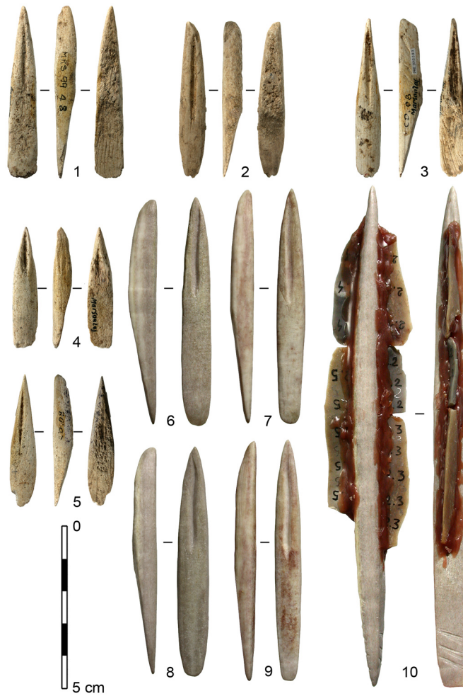
Figure 2. Experimental and archeological antler bevel-based points. 1-5: single bevel-based points, Lussac-Angles type, from Marsoulas (collections of the Muséum d'Histoire Naturelle de Toulouse). 6-9: experimental single bevel-based points, Lussac-Angles type. 10: experimental double bevel-based point equipped with two rows of flint microliths. 6-10 are from the experiment by Pétilion et al. (2011).