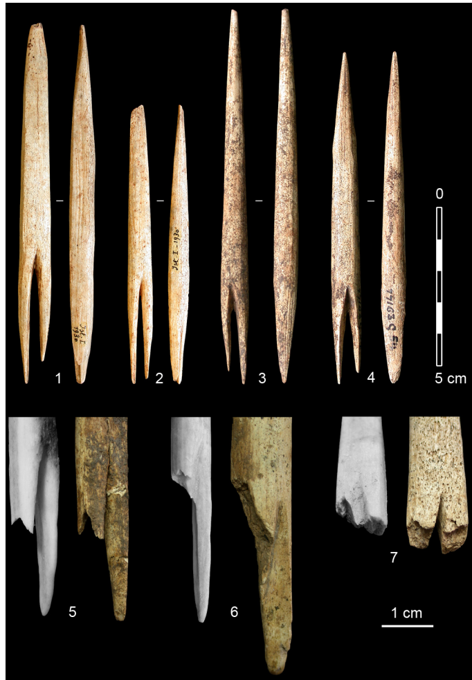
Figure 3. Antler fork-based points. 1-4: fork-based points from Isturitz I/F1 (Saint-Périer and Passemard excavations, collections of the Musée Basque de Bayonne and the Musée d'Archéologie Nationale de Saint-Germain-en-Laye). 5-7: comparison between experimental (left, greyscale) and archeological (right, color) proximal fractures on fork-based points. 5: breakage of the proximal part of a tine. 6: complete breakage of a tine. 7: complete breakage of the two tines. All experimental fractures are from spearthrower shots.