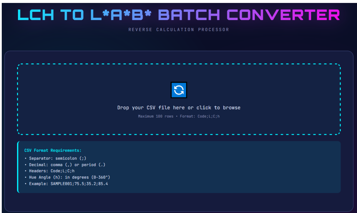
Figure 5: Page for batch calculations of L^*C^*h^\circ to L^*a^*b^* , https://cchervin31.github.io/Lab-color-calculator/lch-to-lab-batch-calculator.html

The calculations performed in these HTML pages were verified as follows.