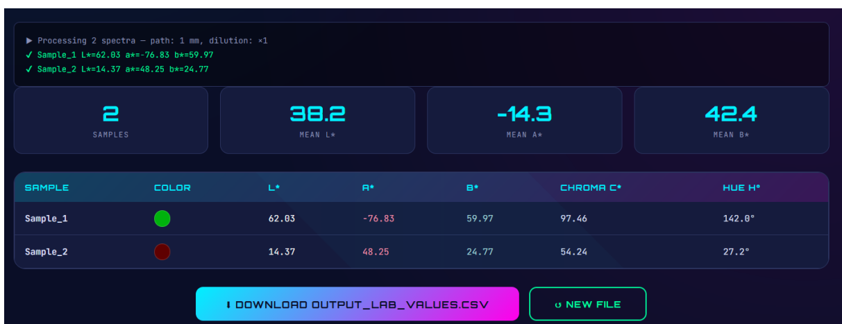
Figure 7: Output screen at the bottom of the page, after calculation of Lab*, Chroma and Hue angle values from various spectra, here examples of mint and red berry sirups.

https://cchervin31.github.io/spectrum-to-Lab/v2-Spectrum-to-Lab_batch.html