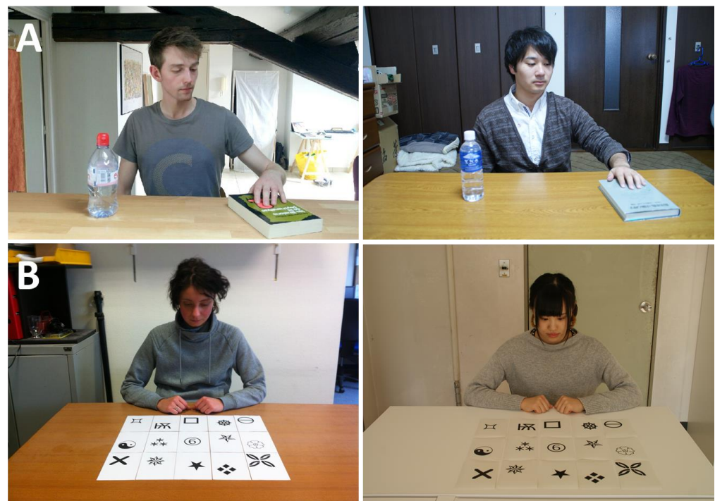
Figure 1. Scenes used depicting (A) a male actor reaching for a book displayed on a table on which there is also a bottle (Tversky & Hard, 2009; Quesque et al., 2018, 2020), (B) a female actor heading toward symbols displayed on a table (Quesque et al., 2018). Each scene could involve a French actor (left panel) or a Japanese actor (right panel).