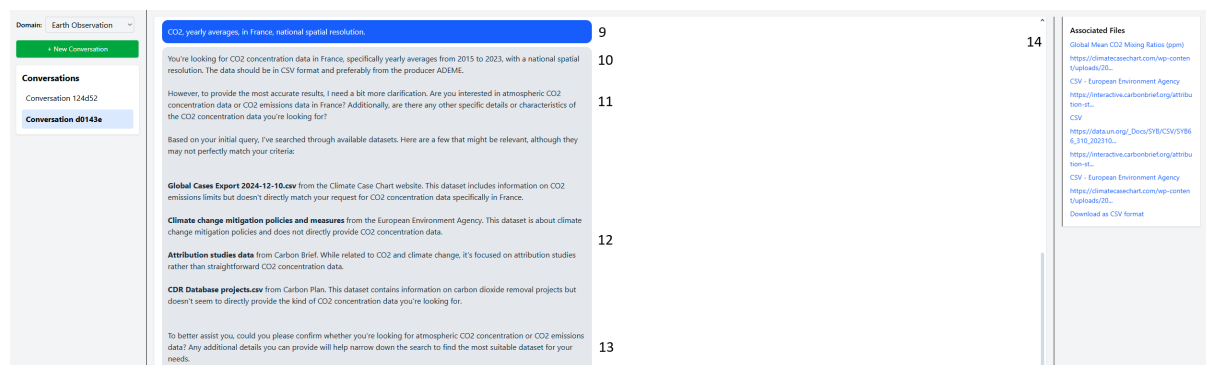
Figure 3: Query “Which datasets are available to analyze CO2 concentration in France between 2015 and 2023 ?” (Part 2)

in CO 2 data (without clarifying whether this refers to emissions or concentrations), with yearly averages, at the national resolution and focused on France. The system responds by (10) reformulating and confirming the updated search criteria, following its established practice of maintaining explicit traceability of user constraints. Since the distinction between emission and concentration remains unresolved, the system (11) reiterates its request for clarification and encourages the user to provide further details if possible. At this point, the system presents (12) four candidate datasets related to CO 2 concentration, each accompanied by an explanation of its relevance with respect to the specified query. The response is concluded with (13) a renewed request for clarification on whether the user's interest lies in concentration or emission data, along with an invitation to refine the query to achieve more accurate results. Throughout the interaction, (14) the datasets retrieved by the system are directly accessible to the user via the file panel displayed on the right-hand side of the interface, ensuring transparency and immediate usability.