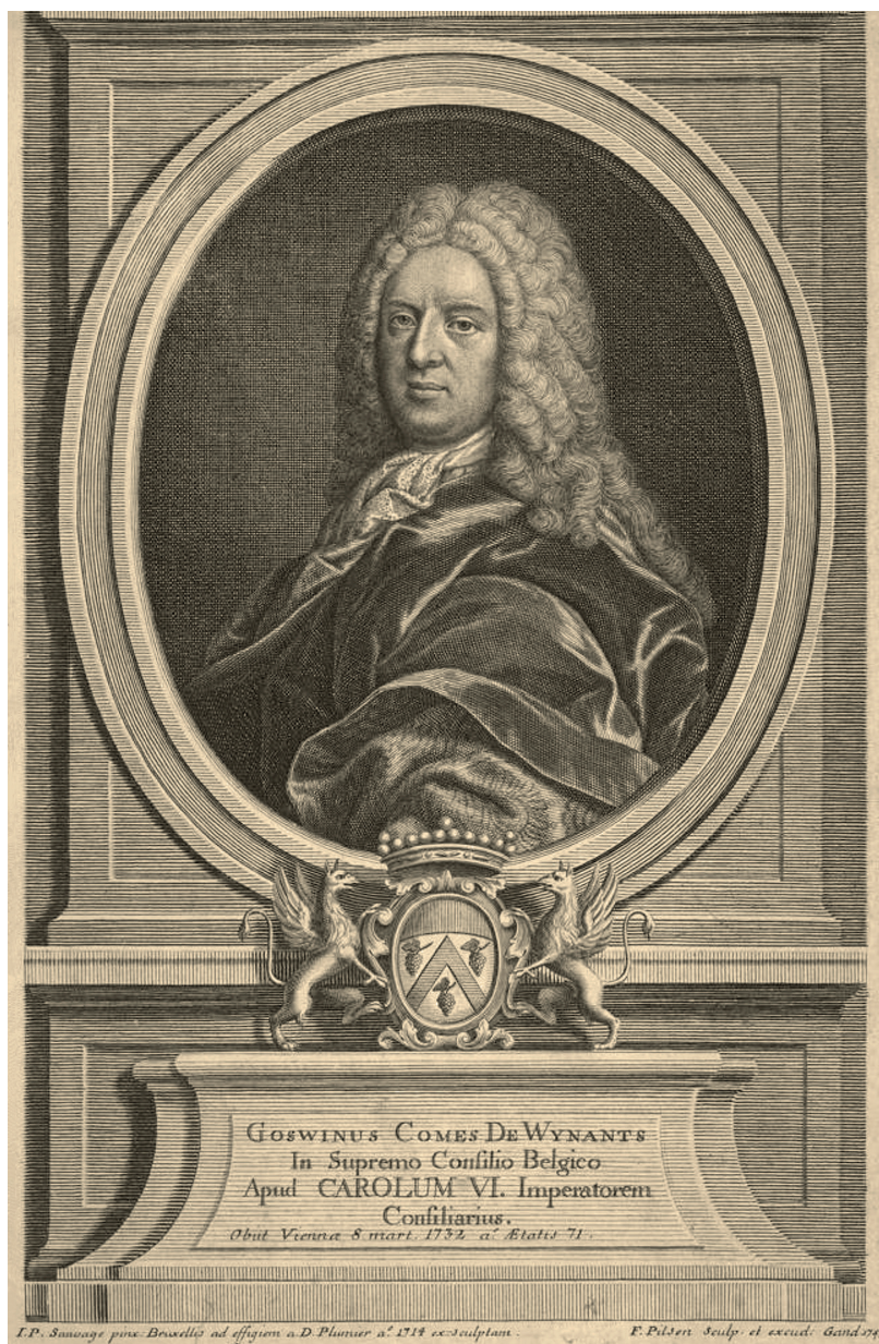
Goswinus Comes De Wynants In Supremo Consilio Belgico Apud CAROLUM VI. Imperatorem Consiliarius. Obiit Viennae 8. Mart. 1732 a o Aetatis 71.