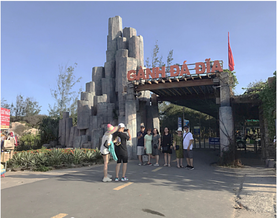
Figure 12.4: Domestic tourists in Gành Đá Đĩa, Central Vietnam.

spatial relationships between public and private (Barbieri and Bélanger 2009). This is striking in a country marked by both Confucianism and socialism, systems in which modesty, a sense of hierarchy, and obedience remain important values.