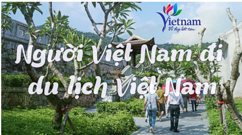
Figure 12.2: Promotional campaign encouraging domestic tourism during the COVID-19 period.

The collapse of international tourism in the aftermath of the COVID-19 outbreak has boosted the recognition of domestic tourism, which had previously been overlooked, even by academics (Peyvel 2016; Bui and Jolliffe 2011). It was officially encouraged by the Ministry of Culture, Sport, and Tourism’s “Người Việt Nam đi du lịch Việt Nam” program (figure 12.2) that began in May 2020 (Nga 2020) and that helps sector professionals promote their offers. Although domestic tourism has not fully compensated the losses of international tourism, it has acted as a significant shock absorber in the face of the crisis.