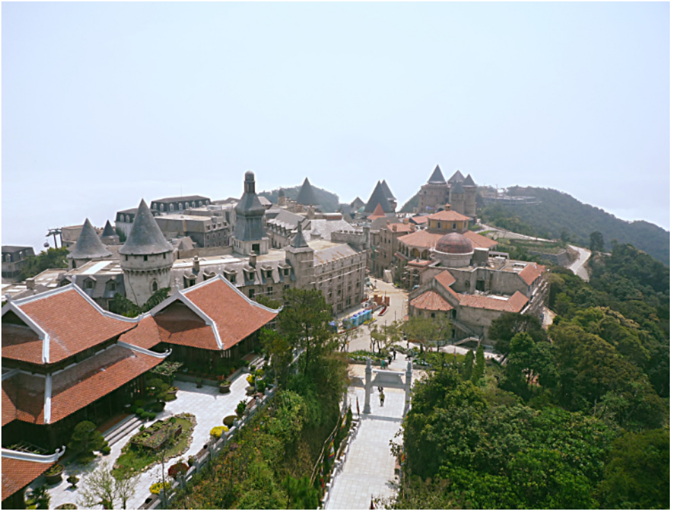
Figure 12.3: Bà Nà Hills, a paradigmatic middle-class tourist destination.

are designed to look down on the natural space, while paradoxically defacing it. As a heterotopia, namely a localized utopia, requiring rigid norms of operation (Foucault 1984), the place deliberately maintains a disconnection from its immediate environment, functioning as an island in it. This results in a strong control of both employees and tourists, who are monitored everywhere and at all times.