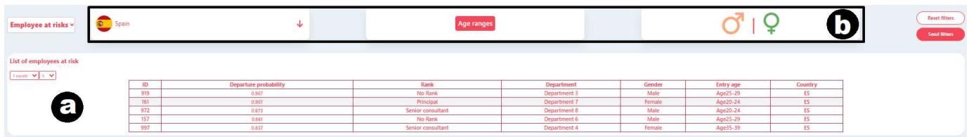
Fig. 2. Dashboard for identifying employees at risk.