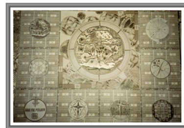
Mandala (Laszlo Najmani)

The project known as The Atheist Church: The Temple of Nuclear Reincarnation was rooted in the broader trend of Chaos Magic and pushed the Spions ethos into a quasi-religious form. Emerging within the punk movement around 1975 under the impetus of Peter Carroll and Ray Sherwin, Chaos Magic regards beliefs as mere tools — to be freely adopted or discarded in order to achieve a goal, their value determined by effectiveness rather than truth. Its aim is to emancipate the individual from the normative structures of belief. To achieve this, one must undergo a process of deprogramming, reaching a liminal mental state where consciousness gives way to the unconscious. For this purpose, Chaos Magic makes use of personal sigils (talismans), the invention of new rites, and the creation of new languages.