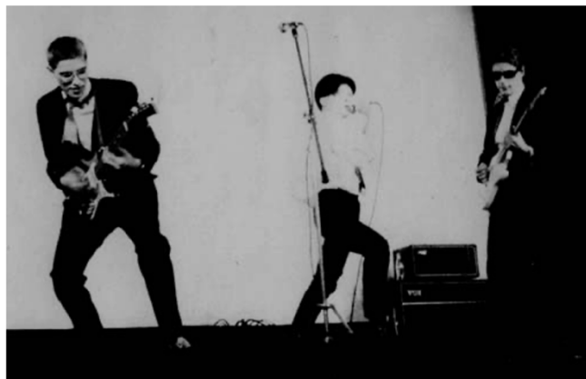
Spions, Budapest, 15/01/1978