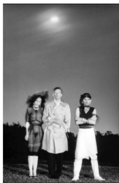
College of Time Consciousness 803, 888, 108 Toronto, Canada, 1983