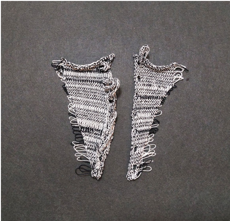
Fig. 2 Ludovica Rosato, Knitted fasteners developed for the prototype, credits: Ludovica Rosato.