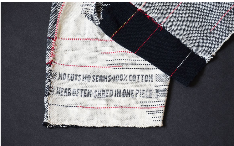
Fig. 5 Juri-Apollo Drews, Informative text woven into the prototype (the image here is a technical draft, the real image will be a photo of the final piece), credits: Juri-Apollo Drews.

Fig. 5. In the current system, the exact composition of the material is not known precisely and therefore not many textile fibres are actually processed into new yarns. To the recycling facility in which the garment is destined to be shredded, however, Trouser Prototype 1 clearly communicates that the garment is fit for mechanical recycling and can be respun into a high-quality recycled yarn after the shredding process. This direct communication is also expected to reassure the wearer and create a sense of emotional attachment. Indeed, users might find it difficult to feel responsible for a product whose materials they are unaware of and are unable to handle when it no longer meets their needs (Rau & Oberhuber, 2019). Informing the user on the sustainable processes applied and thereby inviting them to play an active role in the garment's life cycles is a powerful awareness strategy as it creates amazement and affection towards the product and prolongs the relationship between user and artefact (Chapman, 2009; Karana et al., 2017).