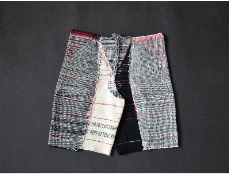
Fig. 1 Juri-Apollo Drews, Trousers Prototype 1, Toile model for "Trousers Prototype 1" currently still in produc- tion, credits: Juri-Apollo Drews.