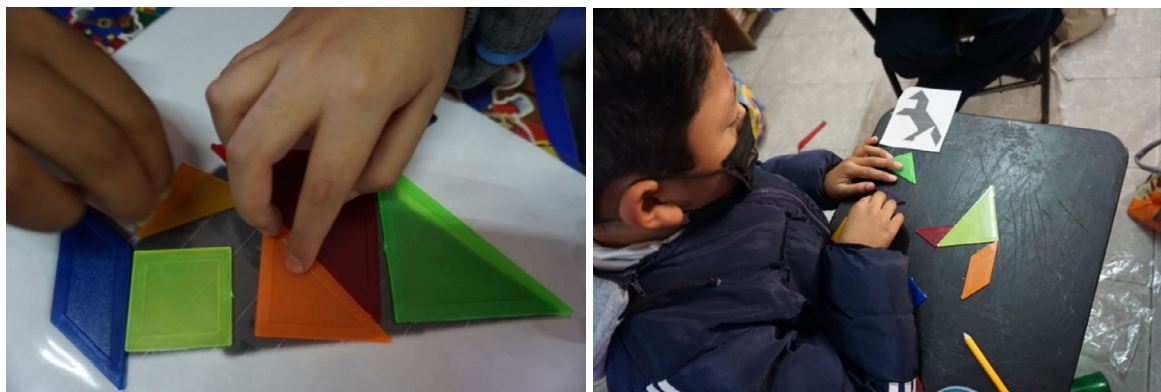
Fig. 3 Examples of the concrete materials used (Alt’s Course 3 report)