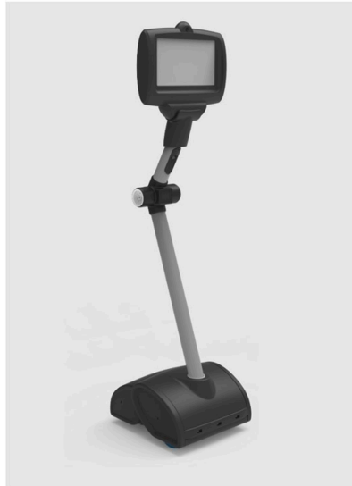
Figure 1. Picture of the Ubbo MTR.