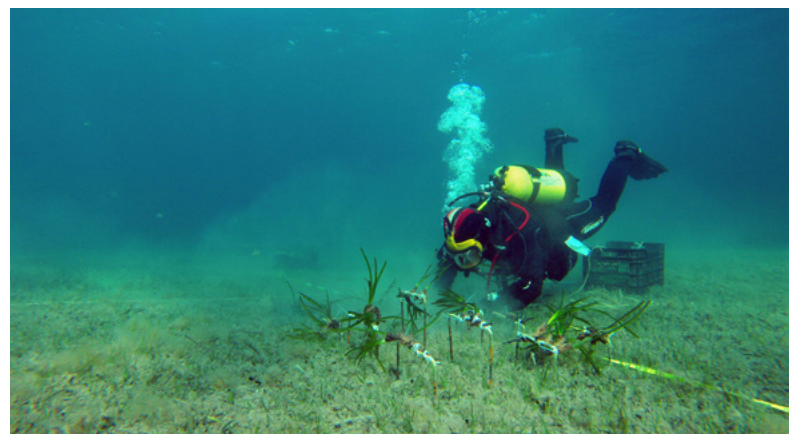
Figure 8. A restoration programme in Spain where floating fragments of P. oceanica are transplanted them into degraded seabeds.

Restoration using seeds and restoration based on rhizome transplants from impacted areas present distinct benefits. Seed-based restoration is generally less costly, more natural, and promotes high genetic diversity, as each seed carries a unique genome. This diversity enhances the range of ecosystem services provided. However, seed availability is limited, typically occurring only once every ten years. In contrast, restoration using rhizome fragments offers the advantage of being available year-round, making it more immediately operational.