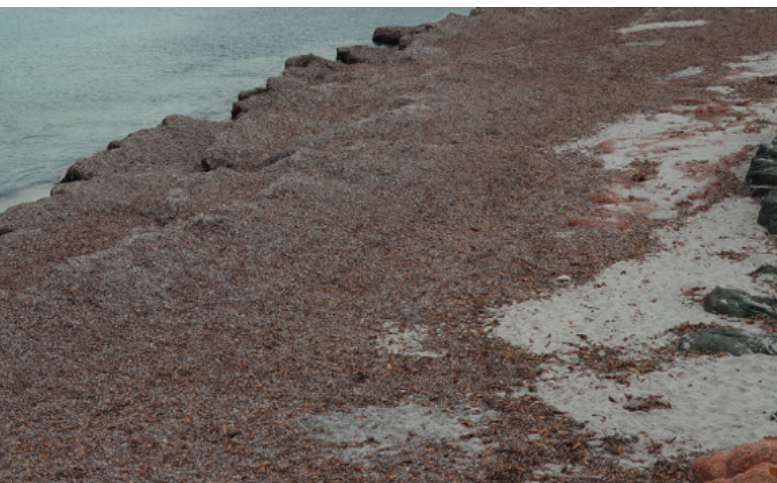
Figure 4. The banquette of dead P. oceanica leaves on Stagnolu beach (Corsica).