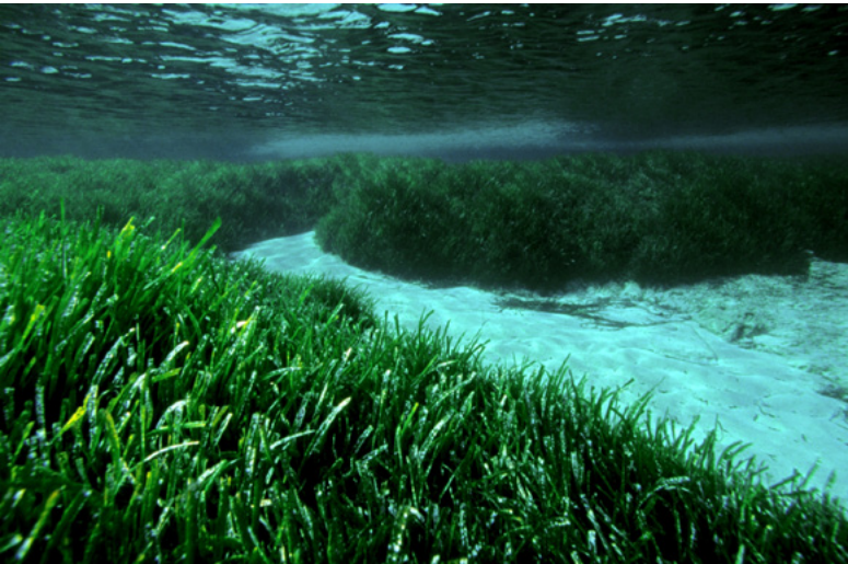
Figure 3. A P. oceanica clonal individual, aged between 80,000 and 200,000 years old, spanning up to 15 kilometers in the Mediterranean.

In addition to the ecological value of P. oceanica for the Mediterranean marine environment, this species has been used in the past in the construction, industrial, and commercial sectors, as well as in the pharmacological field. Twenty-five ecosystem services ranging from provision, regulating and maintenance, to cultural services are provided by P. oceanica meadows. A French judge recently estimated an economic value of about 90 000 €/ha/year (Tribune, 2024). For Mediterranean countries, there is an estimated regression between 10% and 30% over 100 years (Telesca et al., 2015). This estimate does not account for several goods and benefits which need more data to be evaluated from an economic standpoint. The economic value of these meadows is estimated to be 3 times greater than that of coral reefs, 10 times greater than that of tropical forests and 100 times greater than that of a terrestrial meadow (Boudouresque et al., 2012).