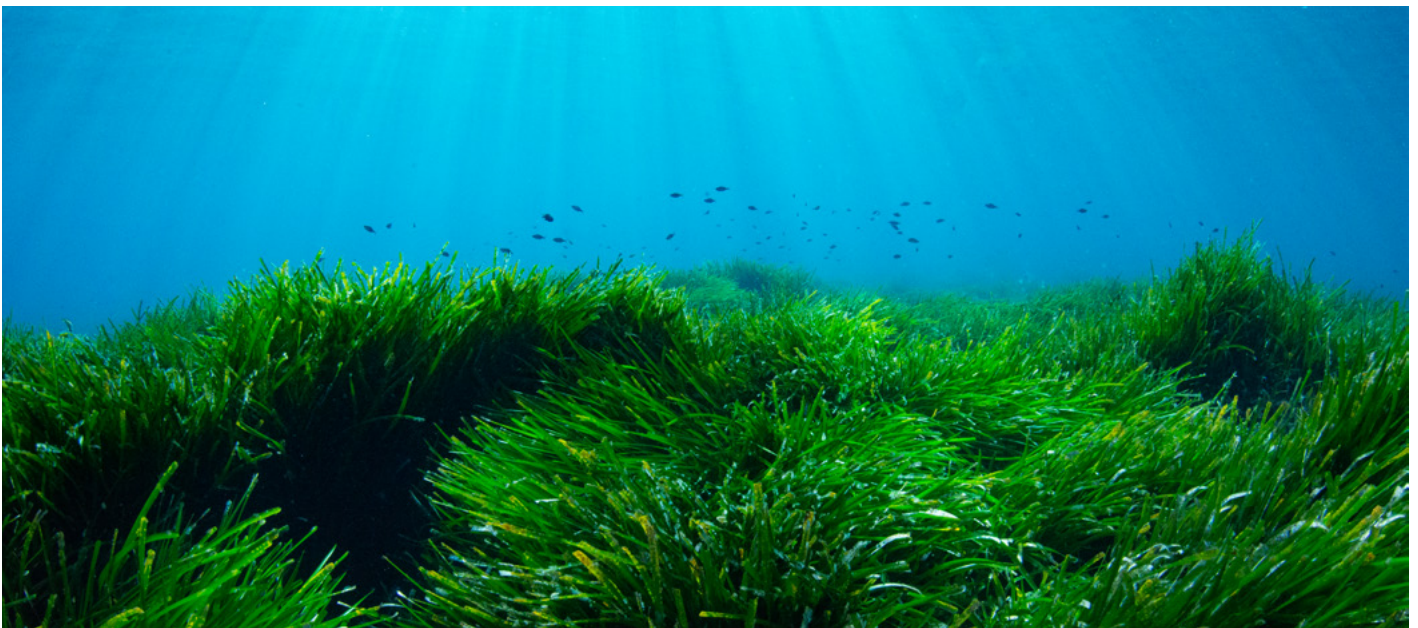
Figure 1. P. oceanica meadows