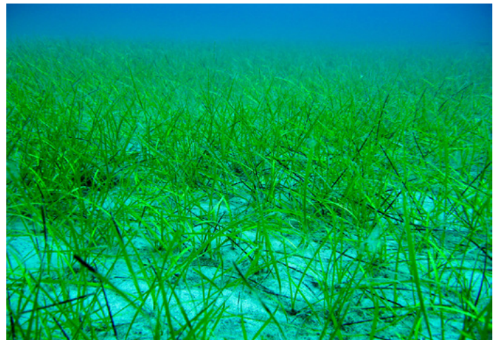
Figure 10. Cymodocea nodosa seagrass meadow in the Bay of Pollensa, Mallorca

• Advancement of restoration strategies. Research is needed on both active and passive restoration approaches for P. oceanica , in alignment with the EU Nature Restoration Law. Among other factors, this includes assessing site-specific ecological effectiveness and costs compared to natural regeneration strategies.