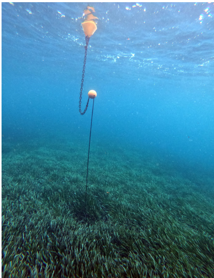
Figure 5. Eco-mooring system

alternatives to prevent anchor drop impacts. For example, in France's Calanques National Park near Marseille, anchoring is banned in P. habitats with mooring buoys installed for boats. Similarly, many Italian marine protected areas, such as the Tavolara-Punta Coda Cavallo reserve, enforce strict anchoring prohibitions supported by fines and surveillance to ensure compliance. In the Balearic Islands of Spain, anchoring on P. meadows is forbidden, with enforcement through regular patrols and extensive mooring infrastructure. Croatia and Greece also implement comparable regulations within their coastal marine protected areas, promoting the use of designated mooring zones and applying variable enforcement measures to limit illegal anchoring activities. Collectively, these efforts contribute to reducing direct mechanical pressures on P. meadows, though enforcement and awareness levels vary across regions.