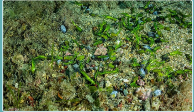
Figure 7. Growth of Posidonia seeds planted into the dead matte) after one month in Marseille

Following the remarkable flowering of P. oceanica in 2022 (André et al., 2023), renamed by GIS Posidonie as potentially the “flowering of the century”, a significant fruiting phase occurred over the winter months. From spring 2023 onward, numerous fruits and seeds were observed both floating at the sea surface and stranded along the coastline. Since of these fruits eventually become stranded on beaches, GIS Posidonie initiated the REPOSEED programme (REStoration of the P. Oceanica meadow by SEEDs), a nature-based active restoration action focused on replanting P. oceanica meadows using seeds gathered from these naturally stranded fruits. Fruit collection sites were required to be located no more than 100 km from the restoration areas, to respect the natural maximum dispersal distance of the fruits. The seeds were then planted following two different methods: either embedded within a coconut fiber mat or directly sown into the dead seagrass rhizome layer (matte). Additionally, two seed densities were tested, with either 100 or 200 seeds per square meter. According to the latest reports from the Marseille seed sowing sites, healthy seedlings have already been observed just a few weeks after planting the seeds although survival rates are low (see Figure 7).