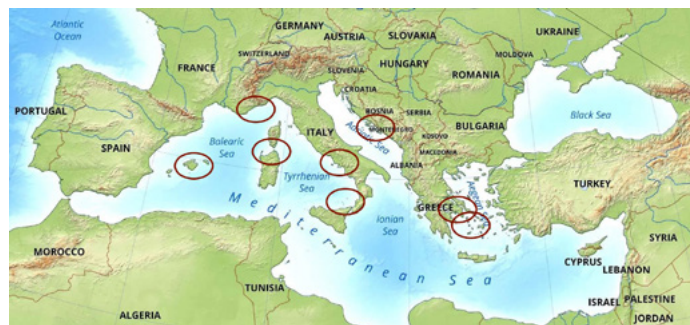
Figure 6. Areas of very high anchoring pressure on P. oceanica meadows

The protection of P. oceanica in the Mediterranean has historically relied on a mix of public funding, and project-based initiatives. Key support has come from European programmes (e.g. LIFE, INTERREG,