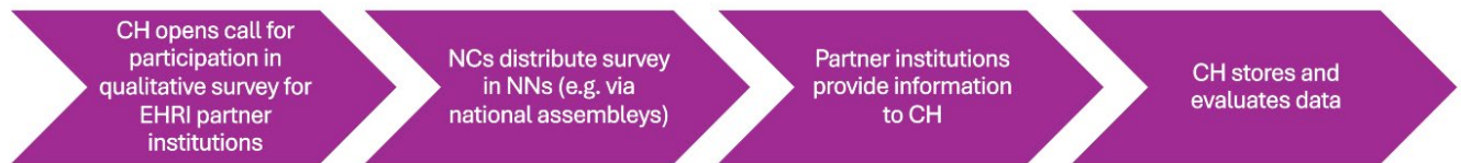
Illustration 7: Workflow monitoring of experts in Holocaust Studies.

An exception is made for cooperating partners, i.e. Holocaust-related institutions located in countries that are not EHRI-ERIC Members or Observers but have entered into a cooperation agreement with the ERIC. 10 In such cases, the CH will consult with cooperating partners to identify the appropriate contacts at the respective institutions. It is also recommended to build on the work carried out in EHRI-IP Work Package 5 (Internationalisation and Partnerships) to identify potentially relevant cooperating partners. 11 Furthermore, the survey can be distributed to institutions in prospective member countries, as identified by EHRI-IP's Work Package 6 (Acquisition of New Members and Funding). 12 This will not only ensure that EHRI monitors activities already underway in institutions preparing to join the consortium, but also enhance their integration into EHRI-ERIC's activities.