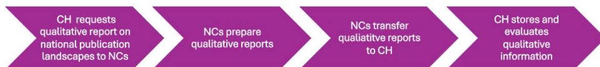
Illustration 6: Workflow monitoring of national publication landscapes.