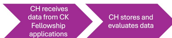
Illustration 2: Workflow monitoring of applications to EHRI Conny Kristel Fellowship Programme

When applying to the EHRI Conny Kristel Fellowship Programme, which will be continued in EHRI-ERIC, applicants will complete an online questionnaire (currently on SurveyMonkey, see Standard application and survey form transnational EHRI-Conny Kristel Fellowship Programme in the Annex), subject to compliance with the GDPR, partly based on the above-mentioned standard questionnaire for the analysis of fellowship applications combined with a standard application form. Once a call for applications is launched, this will allow the CH to continuously receive, evaluate and store relevant data for the scientific evaluations.