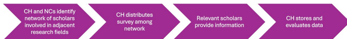
Illustration 8: Workflow monitoring of experts in adjacent research fields.

necessary. As with the survey discussed above, also this proposed questionnaire will need to be reviewed regularly to ensure alignment with EHRI-ERIC's priorities in surveying adjacent research fields. A possible solution for distributing, collecting, storing and analysing the data would be an online survey tool, such as SurveyMonkey.