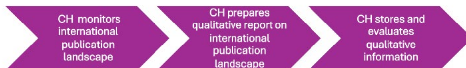
Illustration 5: Workflow monitoring of international publication landscape.

It is proposed that the CH will be responsible for monitoring the international publication landscape (e.g. international journals, monographs covering transnational research topics and questions, EHRI publications) and providing qualitative reports for each monitoring cycle (once every two years).