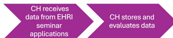
Illustration 4: Workflow monitoring of applications to transnational EHRI seminars.

During the EHRI-3 seminar series, statistical evaluations showed that more than 53% of the seminar participants were researchers, either at PhD or postdoctoral level. 8 Therefore, as with fellowships, applications for EHRI seminars, both at transnational and national level, can provide insight into the current research priorities of the EHRI user community and beyond. As the application process for the transnational EHRI seminars is similar to that of the EHRI Conny Kristel Fellowship Programme (however differences lie in the EHRI partner institutions' participation in the decision-making process) it is recommended that the relevant data from the seminar applications be collected using a standard online form (based on the standard questionnaire and the former standard application form) and processed similarly as described in the previous chapter.