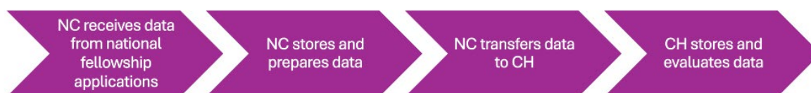
Illustration 3: Workflow monitoring of applications to national EHRI fellowship programmes.

Several NNs offer (or plan to offer) EHRI fellowship programmes at a national level. It is recommended that NNs offering national EHRI fellowship programmes adopt a similar approach to data collection as the CH and transfer this data to the CH once the respective call for applications is closed and the data is stored and prepared. As with the central level, NCs may use the above-mentioned online questionnaire developed jointly by the CH and WP 4 to extract data from applications to the national EHRI fellowship programmes. The standard data received and extracted from these applications shall be provided to the CH on a regular basis, e.g. annually or once a respective call for applications has been closed. In order for EHRI-ERIC to make use of their data, applicants to national EHRI fellowship programmes must agree to its use.