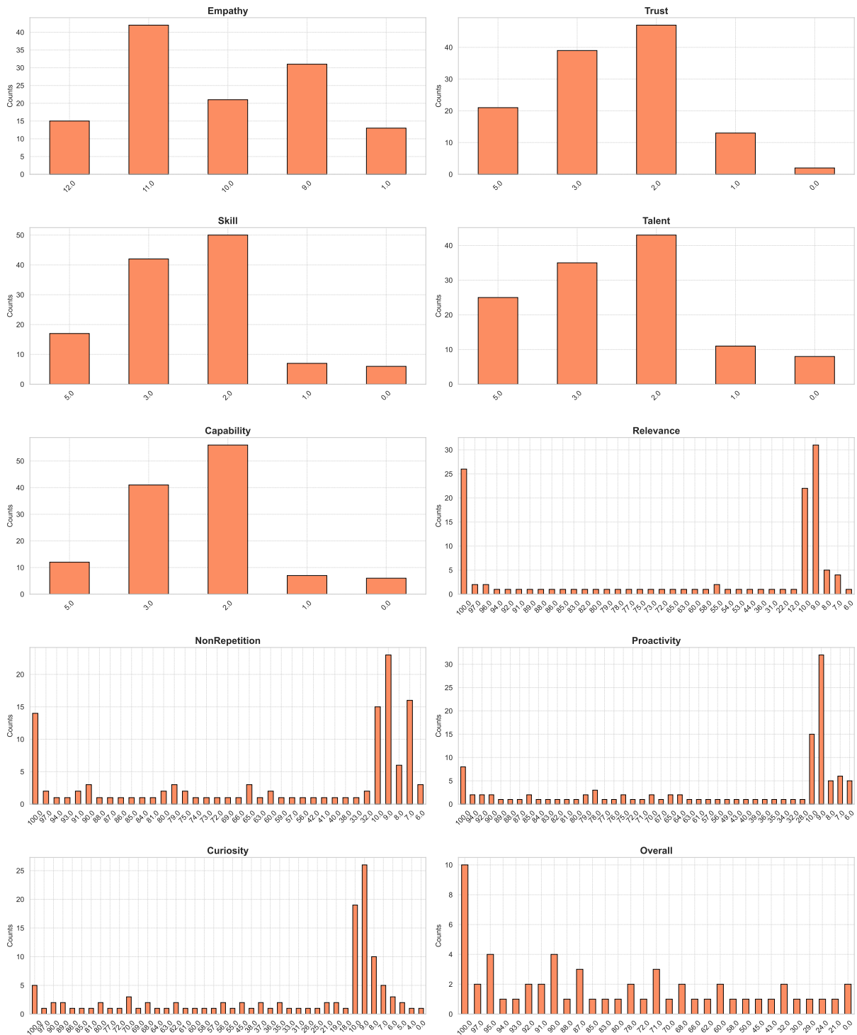
Figure 2: Distribution of human annotations by evaluation dimension in the training set.

sincere, reliable, and honest, whose responses seem true and not harmful or intended to trick the user.