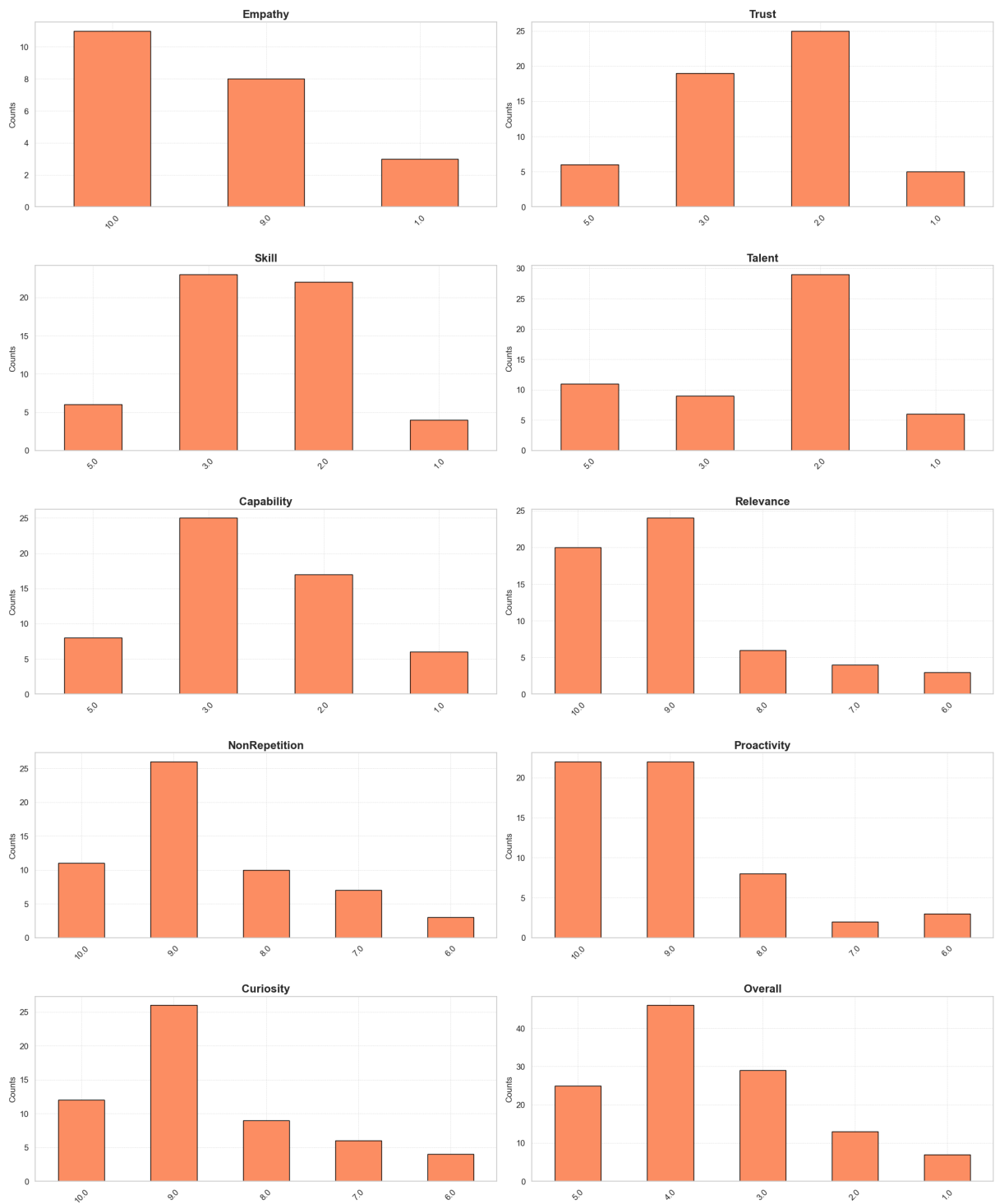
Figure 3: Distribution of human annotations by evaluation dimension in the test set.