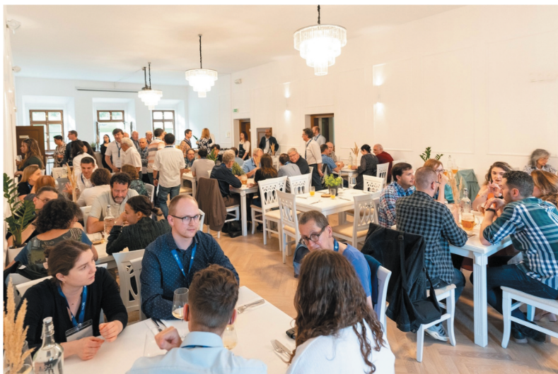
Figure 4. Conference dinner at the Vila Kajetánka, close to the venue of the conference.