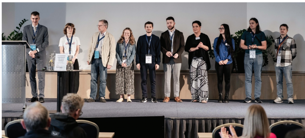
Figure 5. The team of organizers of the 17 th European conference on liquid crystals.