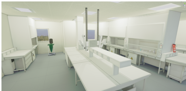
Fig. 1: Virtual chemistry laboratory environment.

on the organization and transformation of matter, specifically on identifying whether a solution is acidic or basic using pH measurement. This topic, introduced in lower secondary school in the French curriculum, offers a simple context that requires no prior knowledge and is accessible to various profiles of learners.