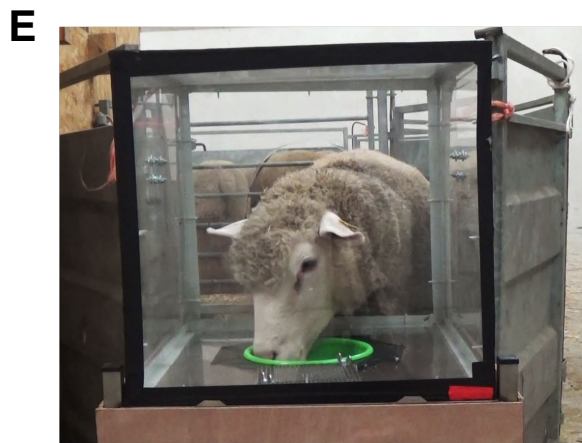
Figure 1. A. Three-quarter view with external dimensions of the PMMA box and the single opening (grey oval) that allows the animals to place their head inside. B. Top view with internal dimensions of the PMMA box with the location of the round green plastic trough (green circle) and the location of the OS impregnated cotton placed under a grid (blue rectangle). C. Schema of the experimental building, waiting and testing rooms. The corridor measures 2.4 meters in length, with each zone measuring 80 cm. D. Training phase: Animals are trained to eat in the round green plastic trough (green circle) in presence of 2 to 3 other animals. E. Animal during the test with the head in the PPMA box.