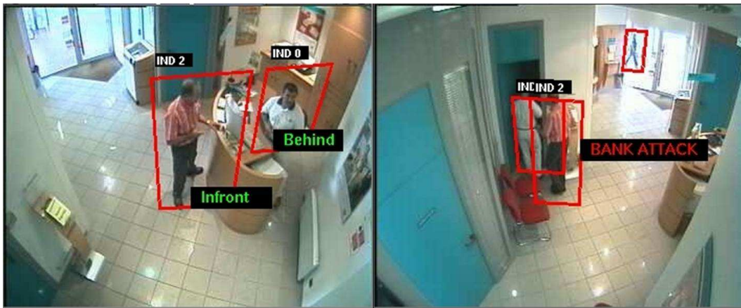
Figure 3. Example of images coming from a bank monitoring application.