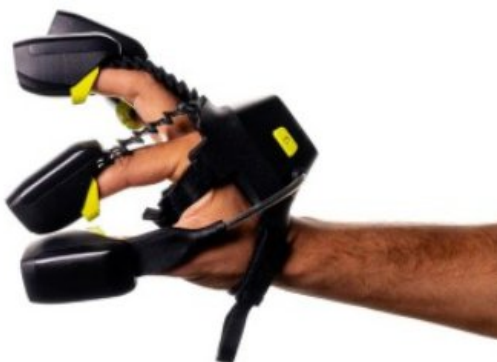
Figure 1. Wearable haptic systems for the hand. WEART ( weart.it )

Traditionally, haptics has lived at the intersection of mechanical engineering and computer science - think vibration motors in game controllers or force-feedback joysticks. But recent breakthroughs in cellular mechanotransduction - recognized by the 2021 Nobel Prize - have dramatically expanded the landscape. We now better understand how ion channels in afferent nerve endings respond to mechanical stimuli, and how different protein expressions modulate sensitivity to pressure, vibration, or temperature. Materials science is rapidly responding with stimuli-responsive polymers and soft actuators that can dynamically alter stiffness, texture, and thermal properties in real time.