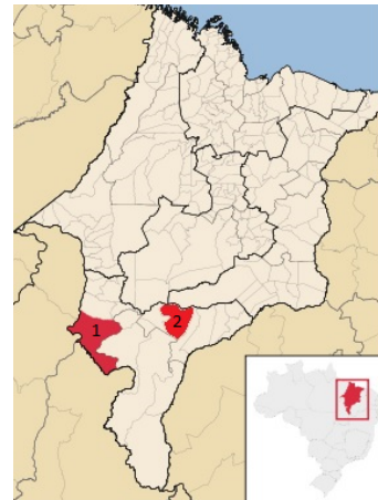
Figure 2 - Municipalities of Carolina (1) and São Raimundo das Mangabeiras (2), in the state of Maranhão.