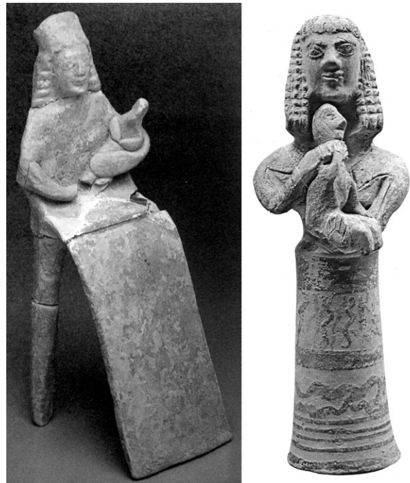
Figure 2: Kourotrophoi from Poseidonia (left: Orlandini 1983: fig. 316) and Tarentum (right: Orlandini 1983: fig. 304).

The importance of what I call mixed chaînes opératoires, i.e. combining different shaping techniques, is considerable in the history of manufacturing. From a technical viewpoint, the combination of moulding and modelling facilitates the shaping of certain iconographies while limiting the risk of deforming the object before firing. The figurines of kourotrophoi discovered in Tarentum and Poseidonia, dated to the end of the seventh century and the beginning of the sixth century BC are a good example of the complex technical choices made by some of the first craftsmen using the mould (Figure 2). 31 In these cases, the mould is reserved for the head, the upper body is made by hand and the lower part can be cylindrical or a flat piece with a support in the back to hold the figure upright. The increasing use of moulding relegates modelling to a secondary position: this is the case in the dressed and naked dedicators of Metapontum 32 or the naked