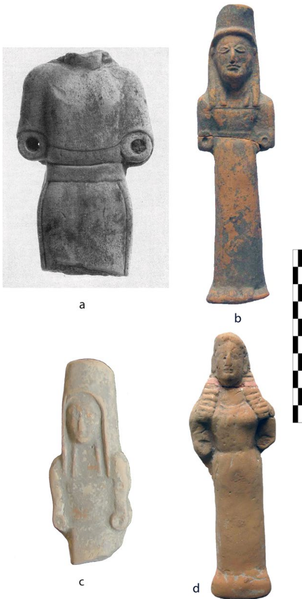
Figure 6: Female figurines with mortise-and-tenon system or related, from Croton (a: Spadea 1994: fig. 8; b-c) and Metapontum (b, c, d: courtesy of the MIC - Musei nazionali di Matera - Direzione Regionale Musei Nazionali Basilicata - Museo Archeologico Nazionale di Metaponto e Museo Archeologico Nazionale di Potenza D. Adamesteanu / photo by the author).

rituals in a religious context. The moulding technique made it possible to produce everyday ex-votos, for which the demand continued to increase with the appearance of new sanctuaries and the intensification of their frequentation, leading to an increase in production volumes and probably to the adaptation of the workspaces themselves. Although moulding and demoulding a figurine are relatively simple technical tasks to carry out, the challenge for the coroplasts in these early workshops lay in the exponential development of their activity during the first half of the sixth century BC, which is reflected in increasingly longer series, rather than in the shaping procedure itself. Indeed, the analysis of production over the long