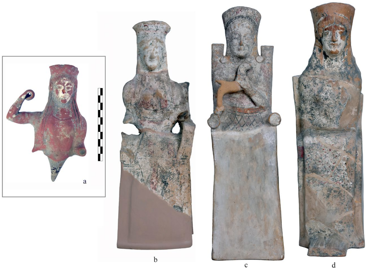
Figure 10: Female figurine in a warlike gesture and enthroned female figurines from Poseidonia.

iconographic type, Bencze identifies four trends, the techniques of which are worth commenting on: in the G and H series, the use of modelling is reserved for the kline (couch) or certain elements such as rosettes , while in the J and K series, the more confident use of modelling for the rich headgear and beards is strongly reminiscent of the techniques attested in the Metapontine material. 45 While these technical choices show that the workshops responsible for the J and K series were familiar with the technical solutions adopted in neighbouring poleis , the dominant use of mould suggests an iconographic choice that strongly characterises the local production.