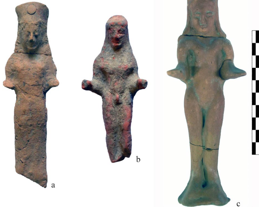
Figure 3: Clothed and naked dedicants from Metapontum (a-b: courtesy of the MIC - Musei nazionali di Matera - Direzione Regionale Musei Nazionali Basilicata – Museo Archeologico Nazionale di Metaponto e Museo Archeologico Nazionale di Potenza D. Adamesteanu / photo by the author) and Poseidonia (c: © Parco Archeologico di Paestum e Velia, Ministero della Cultura / photo by the author).

for which we can mention one where the first variant represents a figure moulded in one piece and clasping its arms to its body ( Figure 4 a-b ), while the second variant has modelled arms stretched forwards in the gesture of offering ( Figure 4 c-d ). Close observation reveals a horizontal mark in the biceps of the first variant, a shallow cut made before firing that does not correspond to any anatomical or clothing element. In the figures with the arms stretched forwards, this mark corresponds to the upper limit of the surface of the modelled limbs, which led me to conclude that the notch was a mark planned by the craftsman in order to facilitate and standardise the creation of the second variant representing the dedicant. This observation sheds light on the way in which the craftsmen planned the creation of two iconographic variants, as early as the shaping of the prototype, or at least before firing, and anticipated beforehand the practical aspects of their manufacture.