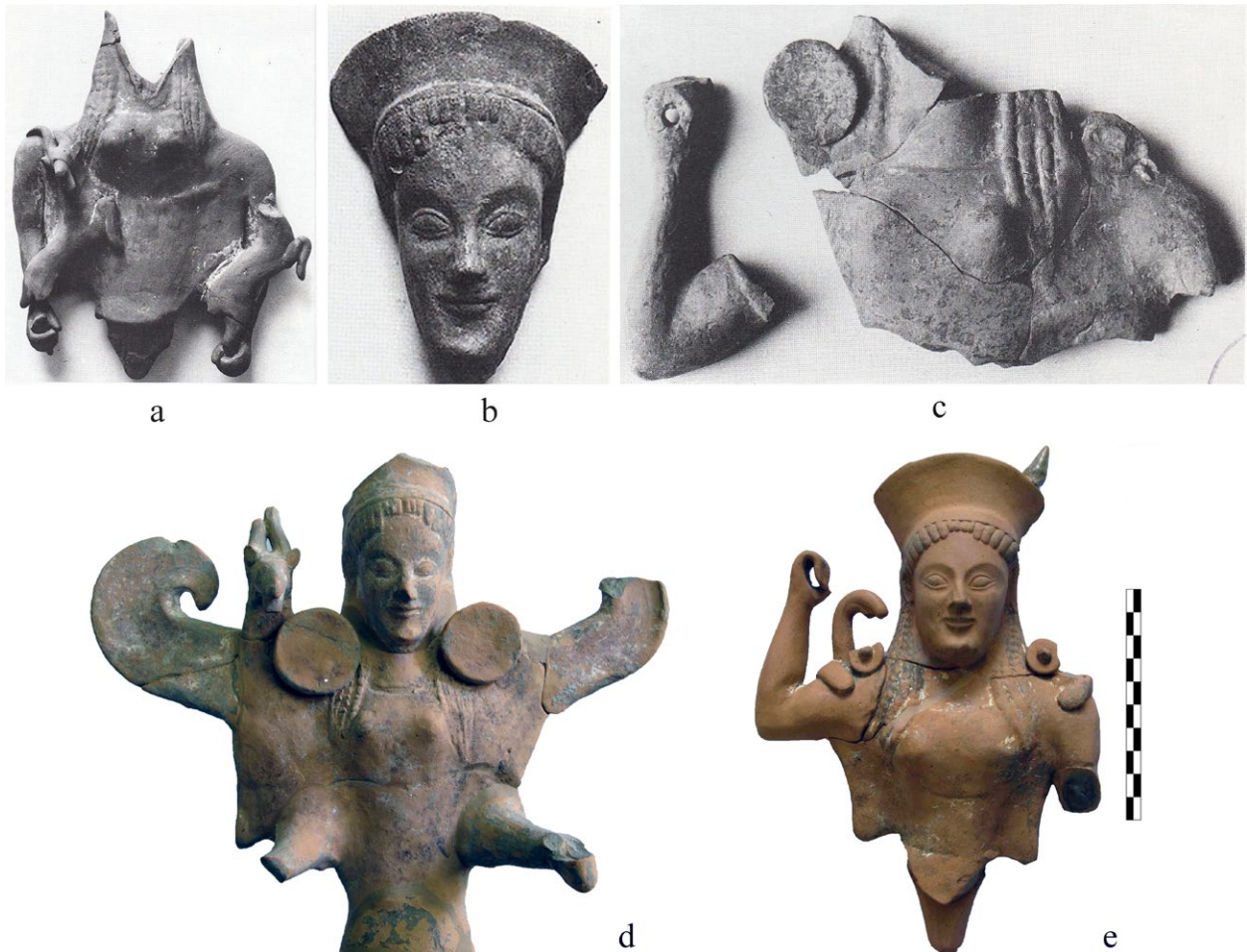
Figure 8: Female figurines in a warlike gesture and representing a potnia theron from Sybaris (a-b-c: Croissant 1992: pl. XL.1-2,5) and Metapontum (d-e: courtesy of the MIC - Musei nazionali di Matera - Direzione Regionale Musei Nazionali Basilicata – Museo Archeologico Nazionale di Metaponto e Museo Archeologico Nazionale di Potenza D. Adamesteanu / photo by the author).

mechanisms of formal emulation and the role that technical choices played within them. This question is vast and the observations made in a few pages can only be partial, but they offer interesting topics for reflection in order to grasp the tight relationship between the choice of technical procedures in coroplastics and cultural processes in the Magna-Graecian environment.