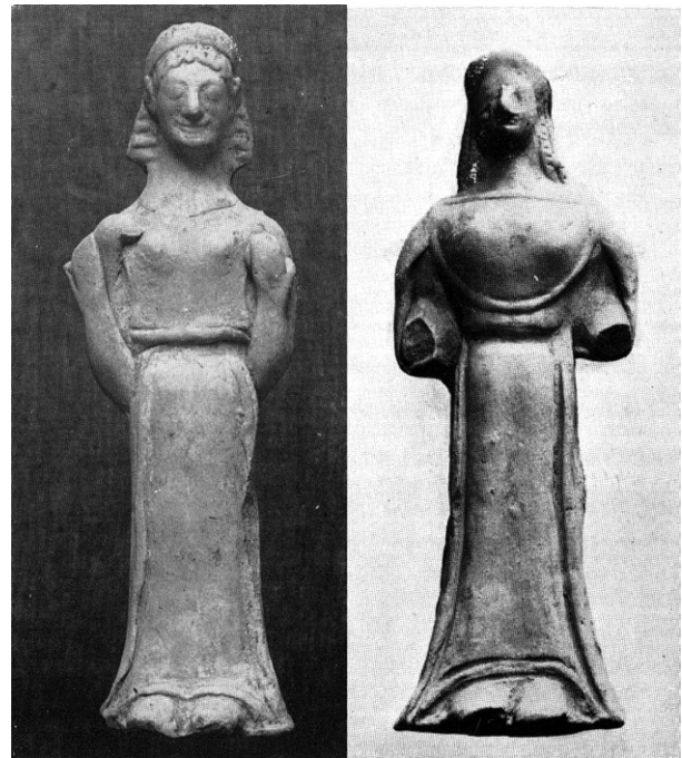
Figure 5: Female types from Locri (Sabbione 1970: figs. 6 and 12).

supposed to accommodate. Among the Metapontine material we should also refer to a type stylistically close to the one adapted into two variants, discussed above, close to the Corinthian plastics, but whose elbows finish also recalls the mortise (Figure 6 d). This formal originality, neither functional nor anatomically faithful, raises questions about the repercussions of these shaping choices, particularly appreciated in Metapontum, upon the use of the object in a cult context.