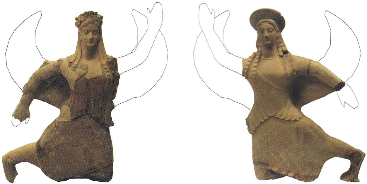
Figure 9: Acroteria from Tarentum (Rescigno 2019: fig. 9).

the same assembling patterns. The upper part of the figures is attached to the lower one by a sort of mortise-and-tenon system, due to which the abdomen ends in a triangular outgrowth, and the backside preserves similar smoothing traces. The craftsmen who conceived and shaped these complex figures demonstrate a refined mastery of anatomical modelling, as the elegant faces attest, and great expertise in dealing with the technical challenges of large pieces via balancing the weights so that the figure may stand upright. As I proposed previously, these two types in particular share the same technological and stylistic characteristics, leading us to ascribe their creation to a single workshop. 41 Comparative archaeometric analyses would be welcome to provide supplementary data on this matter.