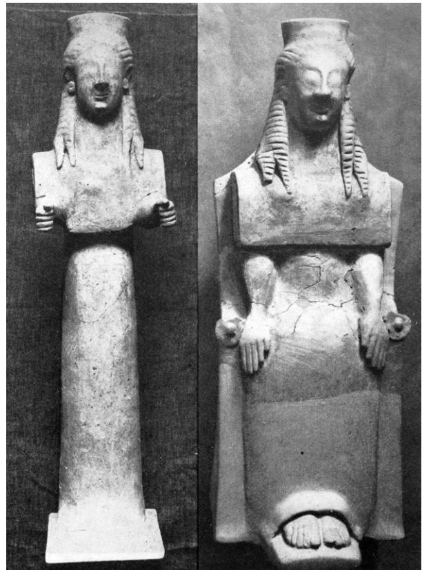
Figure 11: Female mixed-technique figurines from Locri (Arias 1976: pl. LIX 1-2).

relationship of these workshops with the Locrian sphere. The production of terracotta figurines in Locri was not particularly intensive before the middle of the sixth century BC but, in the second half of the century, it gained new momentum through both iconographic and technical choices. 48 The many moulded Locrian protomai 49 (busts) could be considered as an indicator of the proximity of Locri to the Sicilian cultural milieu, while other contemporary creations seem more original. This is the case of the mixed-technique figurines called a leggio (Figure 11), 50 which appear rather isolated in the Magna-Graecian panorama. On the contrary, it seems to me that the cultural issues surrounding these creations only take on their full meaning when integrated into a regional-scale study.