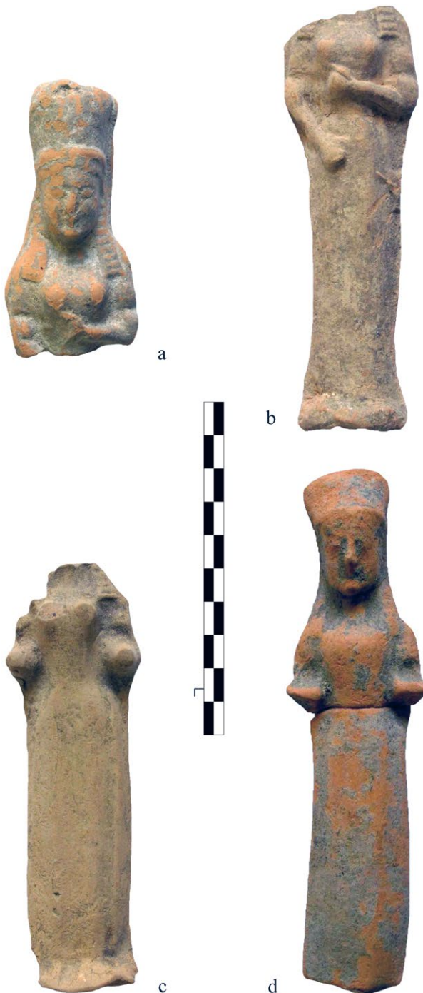
Figure 4: Female types adapted into two variants from Metapontum (courtesy of the MIC - Musei nazionali di Matera - Direzione Regionale Musei Nazionali Basilicata - Museo Archeologico Nazionale di Metaponto e Museo Archeologico Nazionale di Potenza D. Adamesteanu / photo by the author).

supposed to accommodate. Among the Metapontine material we should also refer to a type stylistically close to the one adapted into two variants, discussed above, close to the Corinthian plastics, but whose elbows finish also recalls the mortise (Figure 6 d). This formal originality, neither functional nor anatomically faithful, raises questions about the repercussions of these shaping choices, particularly appreciated in Metapontum, upon the use of the object in a cult context.