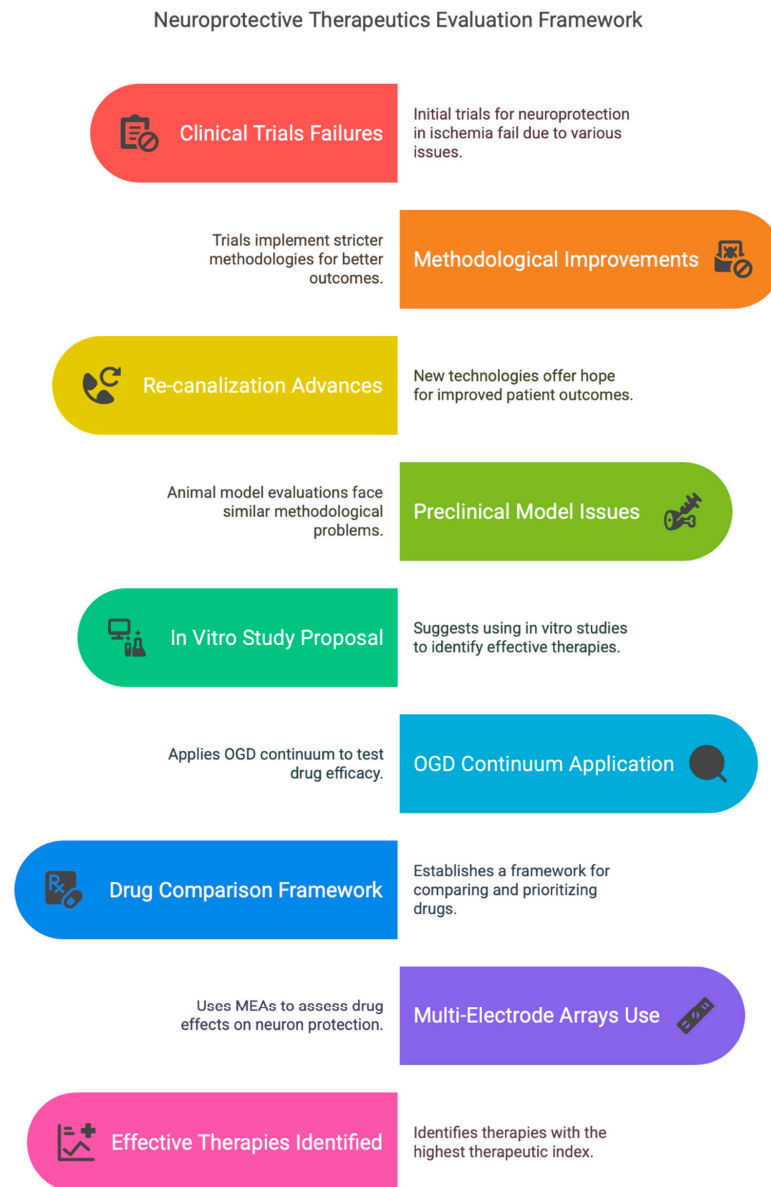
Figure 2. A schematic outlining the rationale used in devising the neuroprotective framework being proposed to prioritize candidates for translation to preclinical animal models. For the past few decades, numerous reviews providing critical insight into preclinical/clinical methodology or neuroprotection in cerebral ischemia frequently concluded by citing new and emerging neuro- or cyto-protective therapies, often in an optimistic (or at least hopeful) context. Due to the absence of a gold standard at the clinical level, as well as the preponderance of preclinical animal model ‘successes’ of therapeutics targeting numerous cellular signaling pathways, considerable confusion exists about which biological targets should be prioritized. Even with a better resolution of what signaling pathway(s) to target, considerable uncertainty also exists about how to choose among the many possibilities that now exist the best candidates for translation. What has been missing is a strategy to de-risk the translational pipeline. Adopting a ‘success from failure’ mindset allows the limits of efficacy and adverse effects of each therapeutic to be defined earlier in the translational process, thereby providing experimentally verified conditions to achieve the highest therapeutic index possible.

have been incredibly frustrated with the unremitting failures, metaphorically losing their minds. The neuroprotective framework offered in this review provides a strategy aimed at preventing this from happening (Figure 2) which, combined with methodological and technical advances in preclinical animal model testing and clinical trials, may usher in a new era in protecting the brain from stroke.