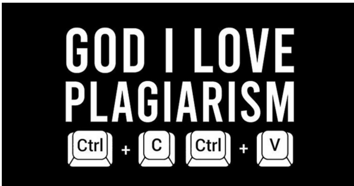
Figure 2: Springer Nature, why not just put it on a t-shirt?

Publicly, the Discover series journals say they’ll accept any science: “Discover journals... provide a home for all research... our remit is to ensure that all research, validated by peers, has a place in a trusted imprint.” And they’ll do it fast: “[X is] a Discover journal focused on speed of submission and review, service, and integrity.” In other words: “we will publish, fast, anything that you send us so long as it we can call it ‘science.’ It doesn’t need to be useful, you just need to pay us thousands of dollars.”