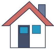
Affordable, quality housing