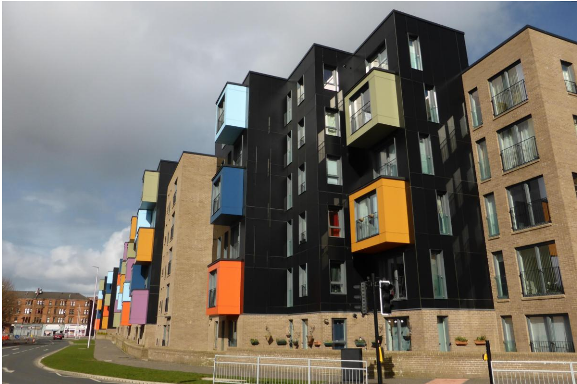
Golspie Street, Govan, Glasgow.