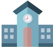
Access to educational opportunities