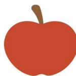
Access to shops and healthy food