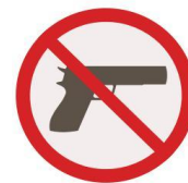
Rates of crime and anti-social behaviour