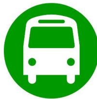
Availability of public transport