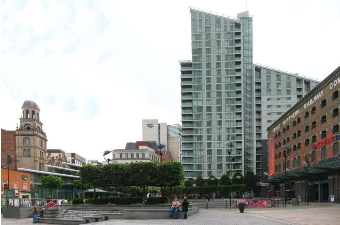
Great Northern Square, Manchester.