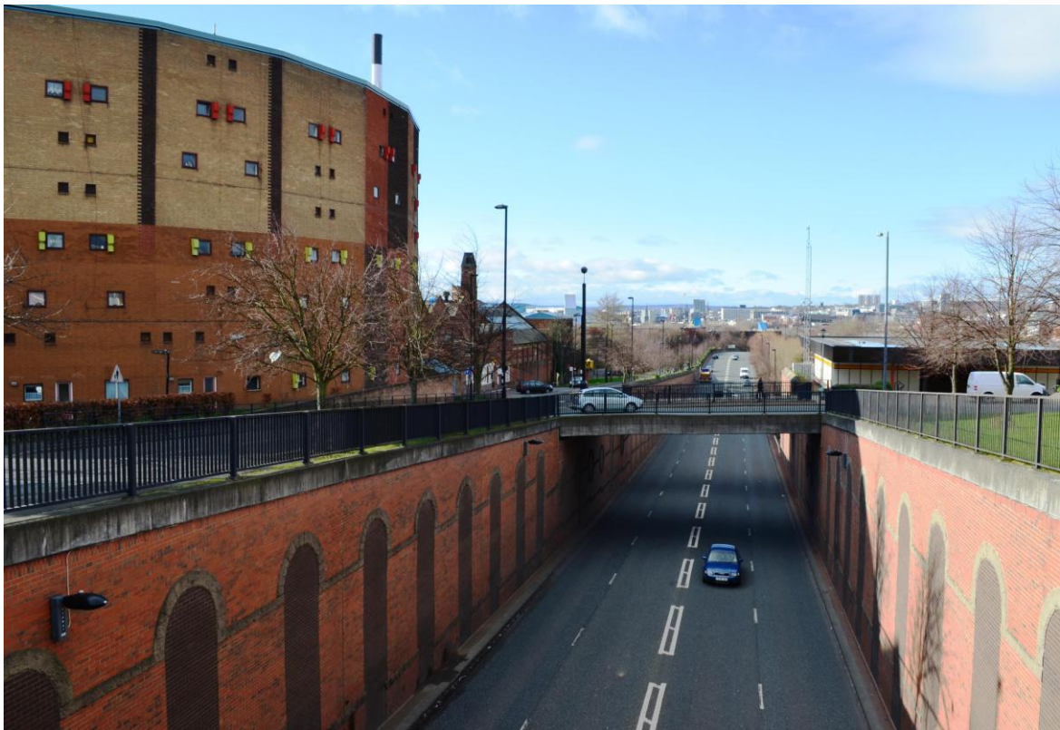
Byker bypass, Newcastle.