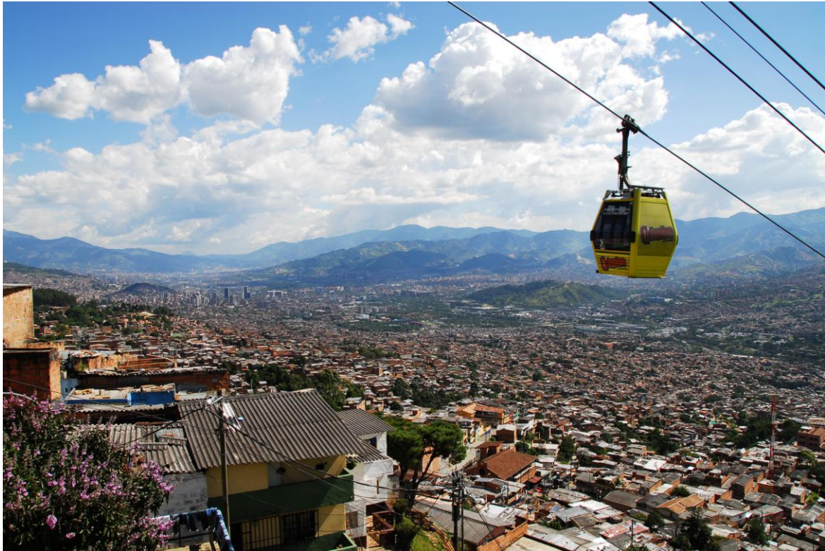
Metrocable in Medellín.

The Colombian city of Medellín has built a transport system that brings together the formal and informal cities and contributes to social cohesion. The Medellín Metrocable serves the difficult to reach neighbourhoods on the city’s hillsides, and residents of the traditionally marginalized settlements. Alongside the construction of the Metrocable, the city took the opportunity to invest in improving the hillside barrios, with the construction of parks, schools, sporting fields, and libraries have been constructed nearby. 97