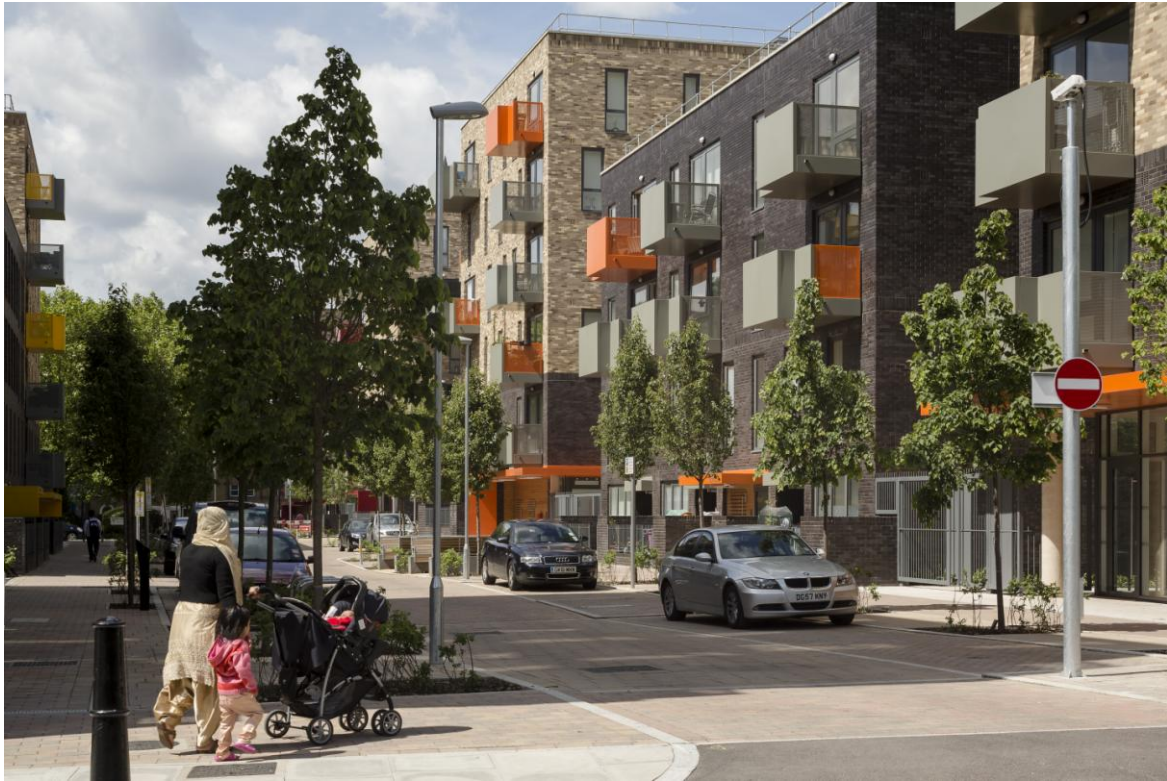
Ocean Estate, London Borough of Tower Hamlets.

The Ocean Estate is located in Stepney, Tower Hamlets, which is amongst the 10 per cent most deprived areas in England. Residents were disillusioned with past attempts at regeneration in the Estate, but were keen for the site to be improved, as it was blighted by street crime and the majority of housing was no longer fit for purpose.