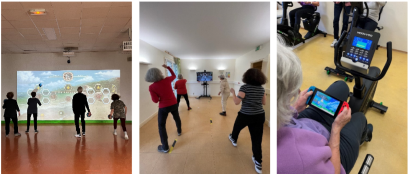
Figure 2. Photography of each group (A) Immersive and Interactive Wall Exergames, (B) SWITCH games, (C) Bike-based Video Games group .

playing without headphones or equipment, so the body controls games. Neo One was conducted standing, offering multi-domain training with collective interactions (ie, cooperation, opposition) between players (multiplayer). Neo One has about 20 games, including sports and puzzle games, that can be played in cooperation or opposition. For this study, the session was composed of 6 games of 5 minutes. The instructions and rules of the games were displayed on the screen and re-explained by the supervisor if necessary. The first 3 games were cooperative, while the next 2 were competitive (2 vs 2). The final game was also competitive but played 1 versus 1.