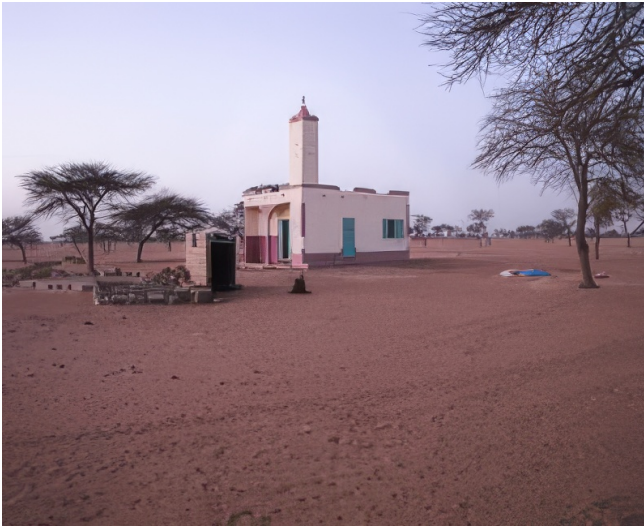
Fig. 9. A mosque.

habitation; on a national level, a tree symbolized the battle against slavery (Fig. 10); and at a societal level, the school building elicited statements of hope about the community's future. (Fig. 11). The ensemble of narratives associated with these photos were particular in the sense that they linked the past, the present, and the future.