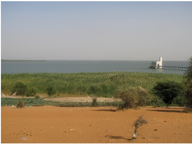
Fig. 6. The lack of space for livestock due to the increase in cultivated fields.