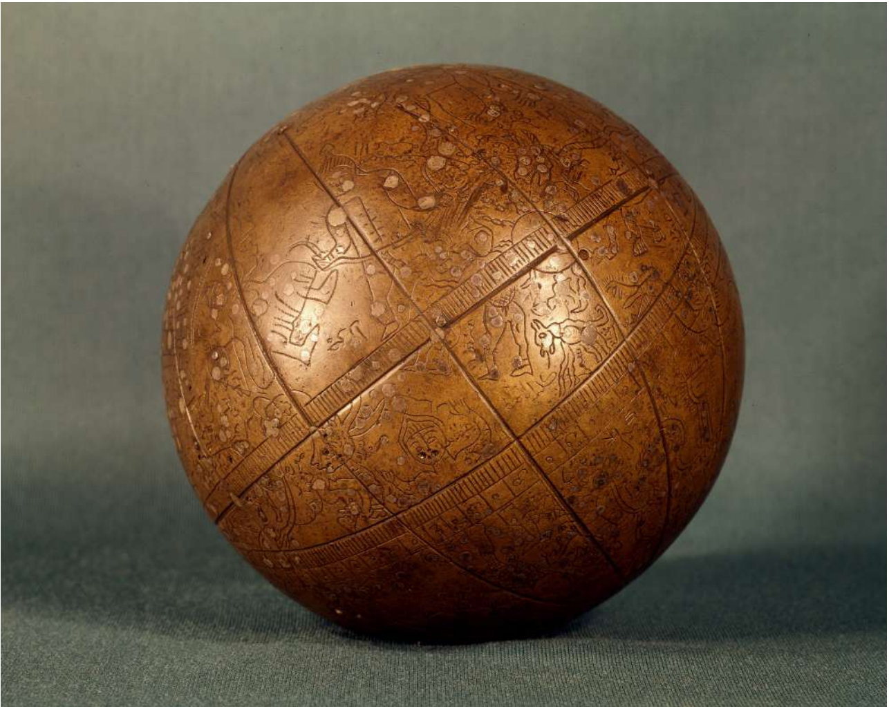
Figure 1. Type A celestial globe made by Jamāl al-dīn Muḥammad al-Hāshimī in 981/1573-74. Bibliothèque nationale de France, département des Cartes et plans, Ge A 326.