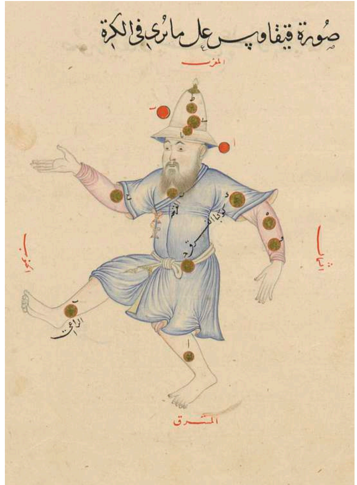
Figure 3a-3b. A comparison of the figures of the constellation Cepheus from two different copies of ‘Abd al-Rahmān al-Šāfi’s Book of the Constellations (Kitāb Šuwar al-kawākib al-thābita). Paris, Bibliothèque nationale de France, département des Manuscrits, Arabe 2492, 136v (3a, on the left) and Arabe 5036, 38r (3b, on the right).