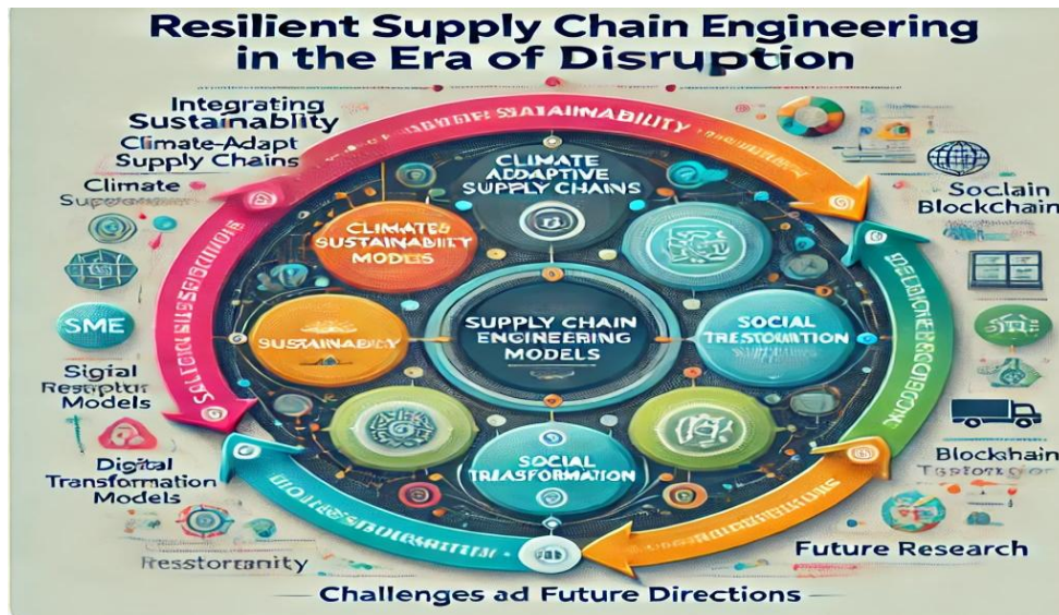
Figure 3: The Thematic diagram of Resilient Supply Chain Engineering in the Era of Disruption (Authors' Design)