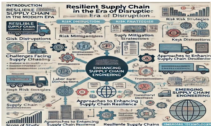
Figure 2: Conceptual Diagram of the Resilient Supply Chain Engineering in the Era of Disruption (Authors' Design)

of understanding ambiguity in supply chains, particularly in the context of crises such as the COVID-19 pandemic, where proactive measures can significantly enhance resilience. Furthermore, Baryannis et al. (2018) highlight that supply chain risk management (SCRM) strategies rely on rapid and adaptive decision-making, which is facilitated by analysing multidimensional data sources. This proactive approach not only helps in identifying vulnerabilities but also enables organizations to implement contingency plans, thereby reducing the impact of unforeseen events on supply chain operations (Baryannis et al. , 2018). Ultimately, the integration of predictive analytics into supply chain management fosters a culture of preparedness, enhancing overall resilience in the face of disruptions. Figure 2 depicts the research ideology connecting the conceptual themes of the research.