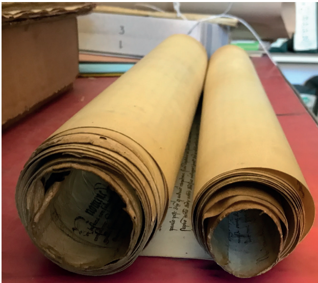
Figure 2. ACC FF2.

For medieval Provence, few judicial documents of the seigneurial system have survived. A trial record kept in the archives of Cucuron 16 offers the rare opportunity to delve into the community of Cucuron's inhabitants —the Cucuronnais— in the years 1412 and 1413 and to get an acute glimpse into a judicial case which is itself a reflection of how the villagers perceived justice, interacted with formal jurisdiction and fought to defend their rights. This trial record 17 takes the form of a well-preserved 5.48-meter-long and 48-centimeter-wide scroll of parchment, written with great care. The scroll is made from nine different pieces of parchment that were combined together end-to-end.