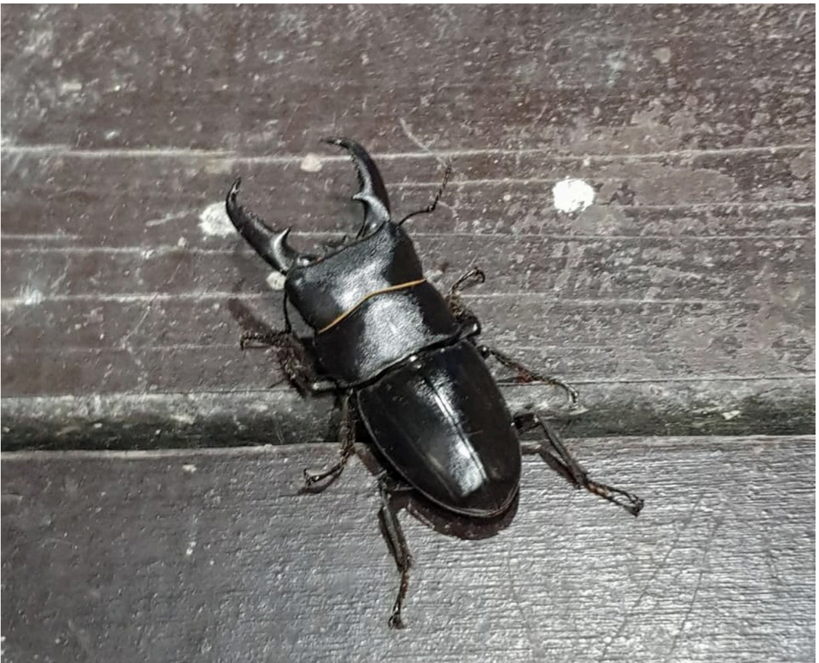
Fig. 8. Field observation of diurnal activity in Serrognathus titanus platymelus (Saunders, 1854) in Lienchiang County (Matsu Islands), Taiwan.