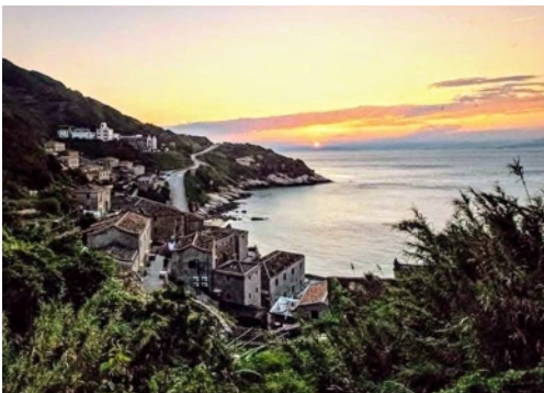
Illustration de la couverture :

This field observation documents Qinbi settlement on Beigan Island, Lienchiang County (Matsu Islands), renowned for maintaining the most intact traditional Mindong architecture in the region - a cultural landscape that parallels our study of endemic stag beetle habitats.