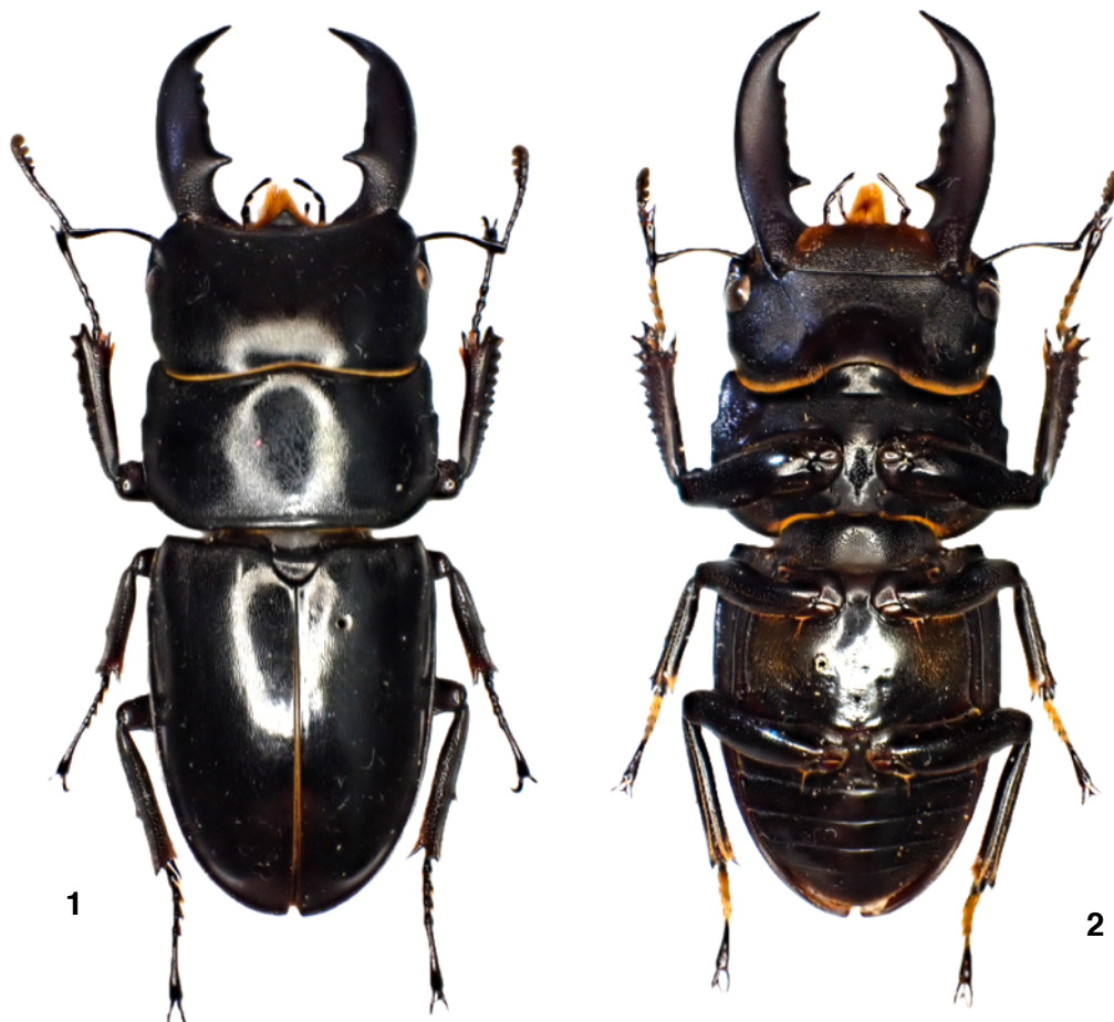
Fig. 1-2. Habitus of small sized male of Serrognathus titanus platymelus (Saunders, 1854) (body length 49.3 mm), (will be stored in NMNS). 1. Dorsal view. 2. Ventral view.