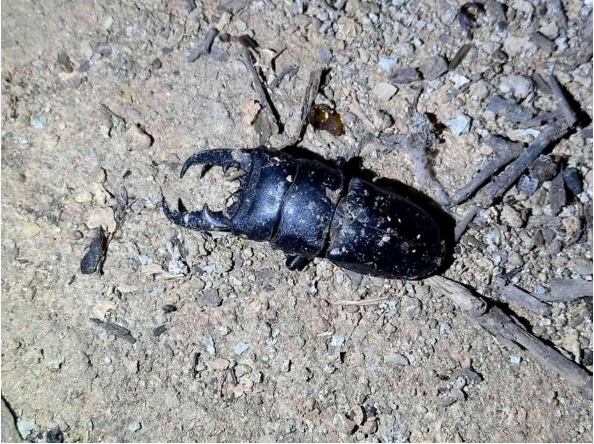
Fig. 7. Field observation of diurnal activity in Serrognathus titanus platymelus (Saunders, 1854) in Kinmen County, Taiwan.