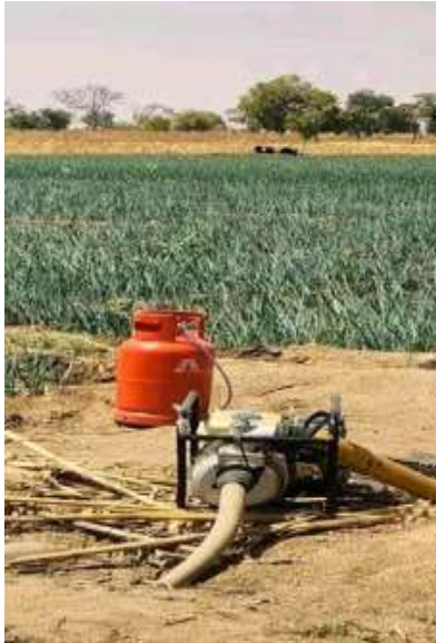
Photo1: Motor-driven pumps gas