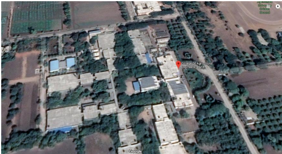
Fig. 1. Location of 45 kWp rooftop grid connected solar power plant