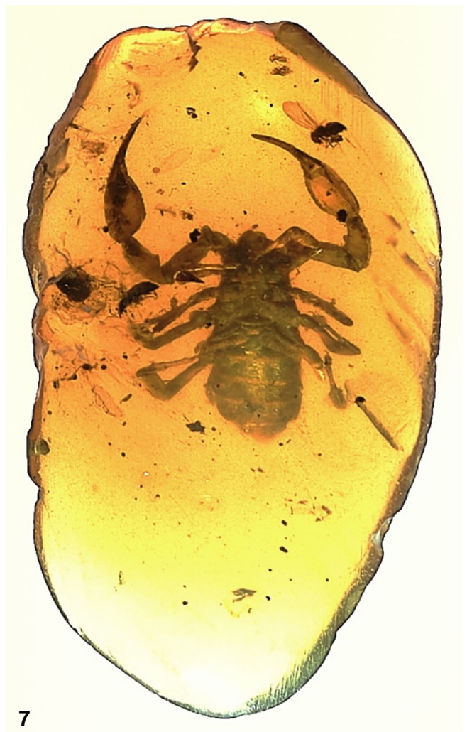
Fig. 6-7. Burmesescorpiops wunpawng sp. n. Male holotype. Habitus. 6. Dorsal aspect. 7. Ventral aspect.

Lourenço W. R. & Velten J., 2020. – A new contribution to the knowledge of Cretaceous Burmese amber scorpions with the descriptions of two new genera and two new species (Scorpiones: Chaerilobuthidae: Palaeoscorpipiidae: Archaeoscorpipiopinae). Arachnida – Rivista Aracnologica Italiana , 28: 34-50.