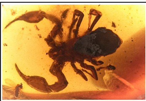
Illustration de la couverture :