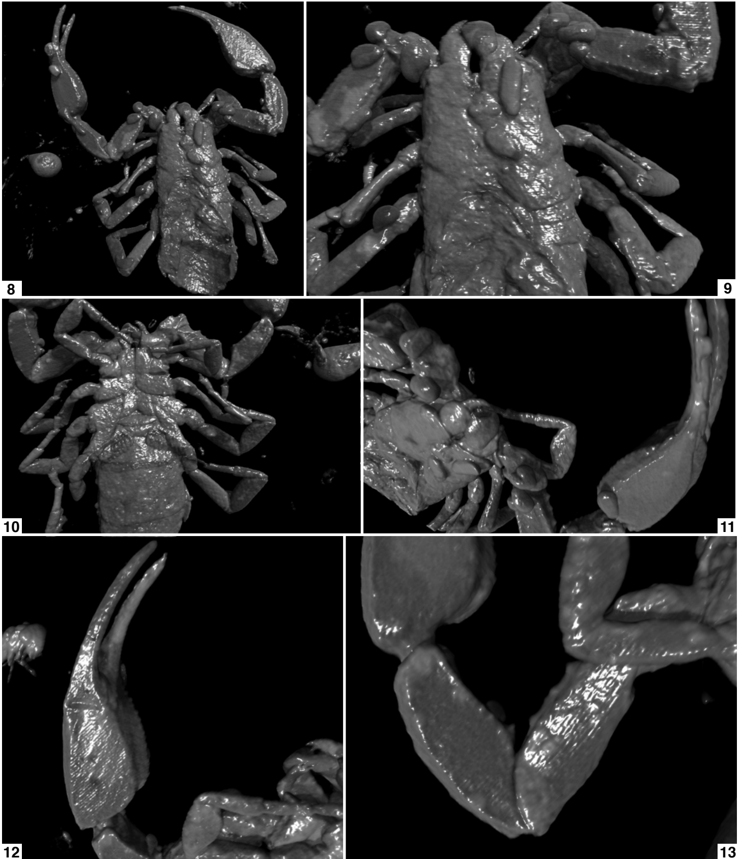
Fig. 8-13. Burmesescorpiops wunpawng sp. n.

8. Habitus, dorsal aspect. 9. Carapace in detail, dorsal aspect. 10. Habitus, ventral aspect. 11. Chela, dorsal aspect. 12. Chela, ventral aspect. 13. Femur and patella, ventral aspect. (Images produced with the use of Micro CT techniques; see material and methods).