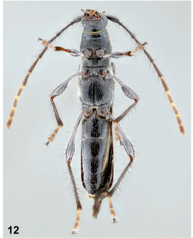
Fig. 11-14. Giesbertectipta variicollis sp. nov., paratypes female. 11-13. Specimen 1. 11. Dorsal habitus. 12. Ventral habitus. 13. Head, frontal view. 14. Specimen 2, dorsal habitus