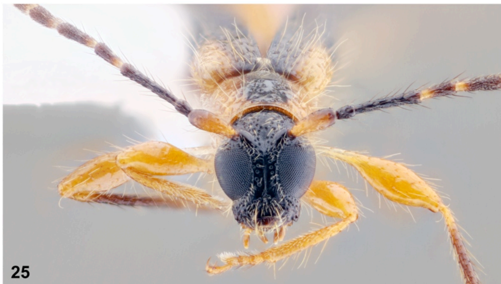
Fig. 22-25. Eclipta moleiroi sp. nov., holotype female (MZSP 67362). 22. Dorsal habitus. 23. Ventral habitus. 24. Lateral habitus. 25. Head, frontal view.