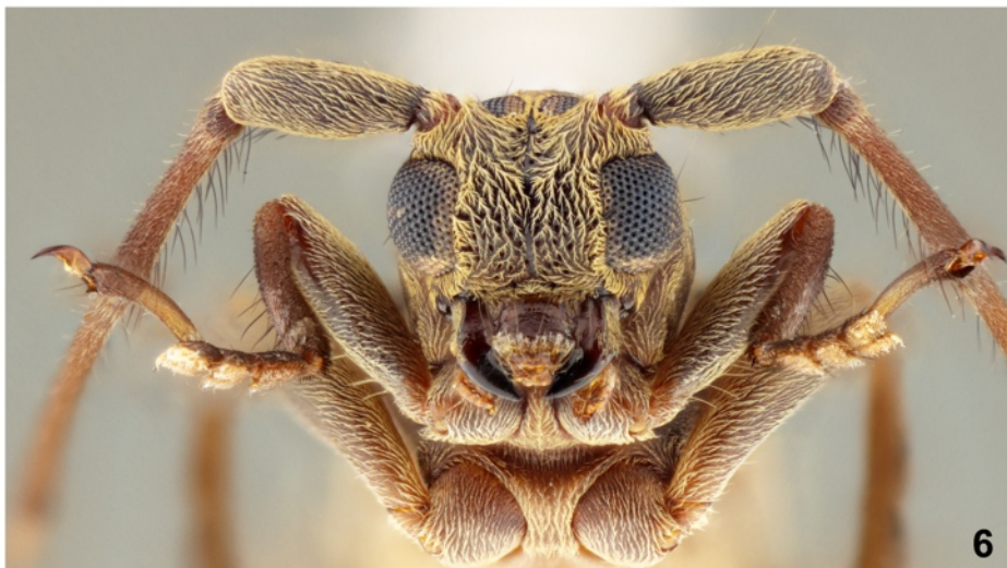
Fig. 3-6. Rosalba nona sp. nov., holotype male.

3. Dorsal habitus. 4. Ventral habitus. 5. Lateral habitus. 6. Head, frontal view.