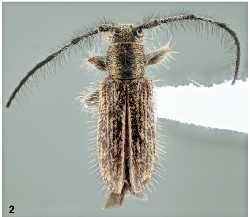
Fig. 1-2. Lamiinae spp.

1. Lepturdrys capixaba Monné et al. , 2024, female (MZSP 67357) from Brazil (Paraná). 2. Eupogonius petulans Melzer, 1933, male (MZSP 67361) from Brazil (São Paulo, São Paulo).