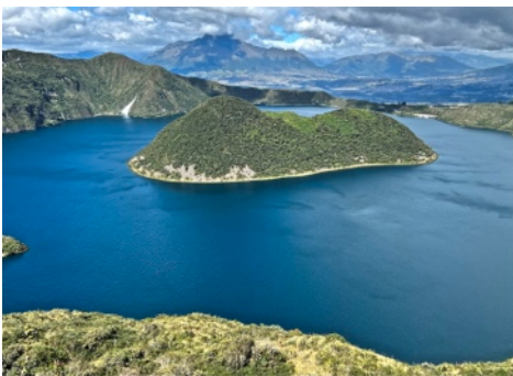
Illustration de la couverture : Laguna de Cuicocha, Ecuador.