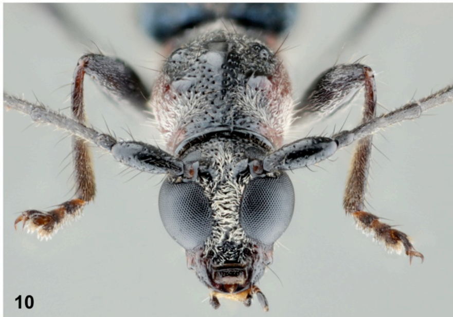
Fig. 7-10. Giesbertectipta variicollis sp. nov. , holotype male.

7. Dorsal habitus. 8. Ventral habitus. 9. Lateral habitus. 10. Head, frontal view.